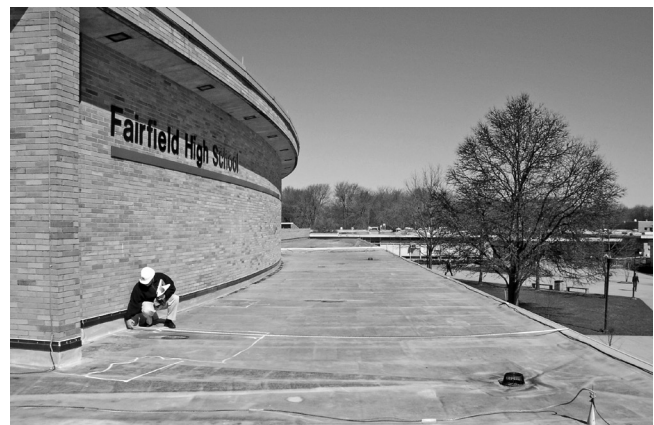
▲ Schools and hospitals often require roofing products that are free of volatile organic compounds to protect sensitive building occupants.