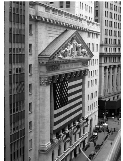
A New York Stock Exchange in New York, New York. Facility-Wide Roof Condition Assessment and Repairs.