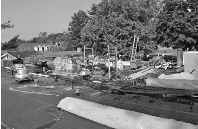
▲ The roofing contractor for this project piled materials and equipment in one spot, potentially overloading and damaging the roof structure.

arise in construction for which the contractor is not prepared. At best, an inexperienced contractor's efforts can incur additional expenses for time and materials; at worst, the roof system might be incorrectly installed, leading to premature failure.