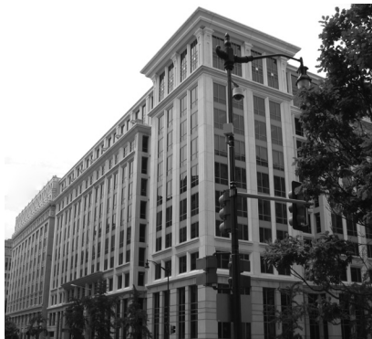
A City Center at 1401 H Street NW in Washington, District of Columbia. Roof Replacement and Penthouse Rehabilitation.

New York, New York Roof Assessments and Replacements