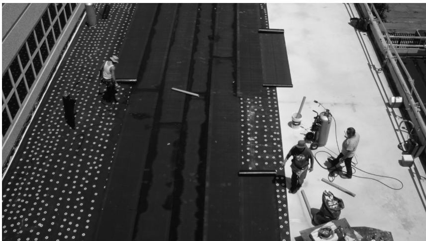
(continued from page 6)

While that's not an unreasonable approach, most building owners and facility professionals will find that planning ahead for roof maintenance and replacement, and responding promptly to signs of deterioration, actually saves money and reduces downtime. By the time a leak is detected at the building interior, water has likely saturated insulation and damaged structural elements, framing, and drywall, to the point that repairing water damage can