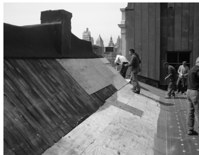
▲ Roof replacement at this corporate headquarters building needed to accommodate changes in roof slope and deck type while maintaining watertight tie-ins with historic building elements.

Of all the major building envelope elements, the roof usually has the shortest expected service life. With this in mind, building owners and managers must consider whether they intend to be proactive or reactive when it comes to roofing distress and failure: in short, to chase after problems or anticipate and prevent them? Put in those terms, the response seems clear. But given the expense and disruption of a reroofing project, many owners and managers would just as soon put it off as long as possible.