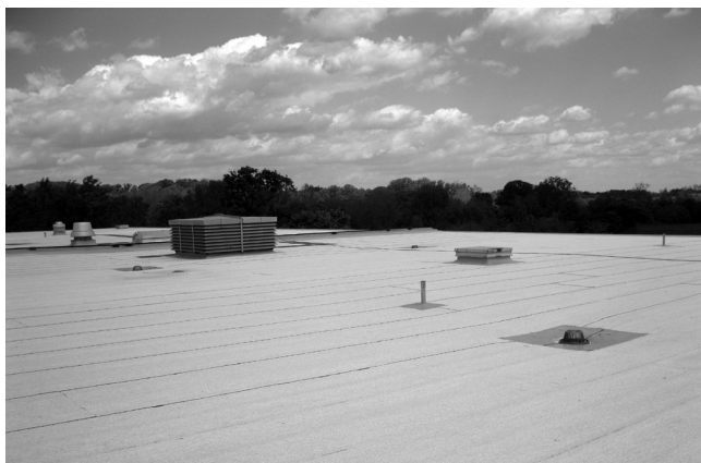
▲ Incorporating a light-colored cap sheet with a high SRI into a traditional modified bitumen roof system can improve energy performance.

Recent and forthcoming ecological building standards, including the 2012 International Green Construction Code, have tightened requirements on environmentally harmful chemicals.