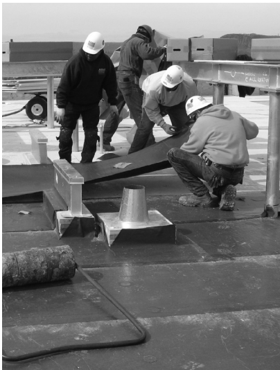
A Planning ahead for roof replacement avoids the unexpected expense of emergency leak remediation.

For many building owners and managers, the first step in a reroofing project is to obtain proposals from roofing contractors. But proposals for what? Given technological developments in the roofing industry and changes in building codes over the past 20 years, replacement in kind might not be the best option—or even a possible option. Without a set of specifications and drawings, contractors will often opt for the cheapest possible assembly to make their bottom line more appealing. A better strategy is to get a detailed picture of existing conditions first, then use that information to select the right roofing system for the job.