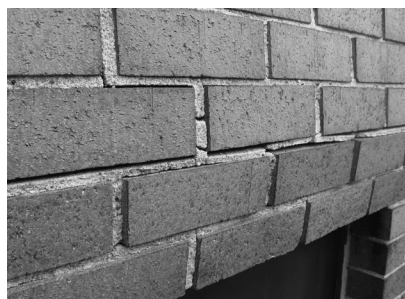
▲ Bowing and displacement in brick masonry are symptoms of restrained movement.