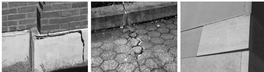
▲ Cracks at foundation-cladding interfaces (left), crumbling pavers at expansion joints (center), and displaced stone or masonry (right) point to insufficient provisions for material movement.

Periodic evaluation should aim to identify early warning signs of restrained movement, from longitudinal cracks at building corners to shifting of parapet walls, with a rehabilitation plan to rectify the condition before it becomes hazardous. For new construction, design should consider the anticipated behavior of all proposed materials in relationship to one another and to the environment, anticipating and allowing for dimensional and volume changes without compromising building integrity. ■