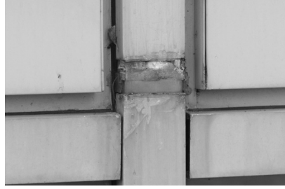
A Metal cladding displacement and exposure of underlying structural steel.

Each type of movement joint is intended to serve a specific function, so they may not be used interchangeably. Some, such as control joints, may be