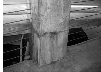
▲ At this garage, movement-related cracking worsened as embedded steel corroded.