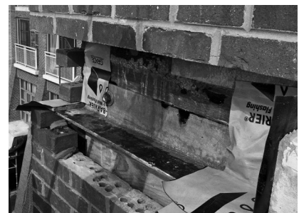
▲ Relieving angles and horizontal joints support masonry and allow for expansion.