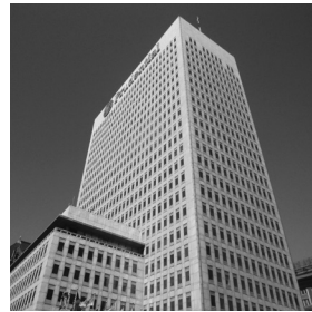
▲ Prudential Plaza Building , Newark, New Jersey, Marble Panel Facade Consultation.