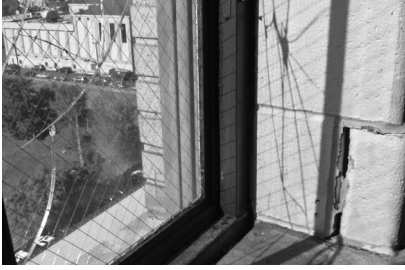
A Shattered glass and displaced concrete block due to building enclosure movement.

joint must accommodate. At corners, offsets, and setbacks in the facade, cladding materials like brick masonry will expand horizontally toward the corner, forming long, vertical cracks and displacement if expansion joints are not provided.