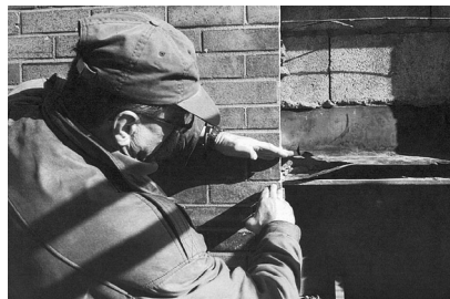
A Inadequate space for the steel relieving angle has caused this wall to bow outward.

Many brick masonry cavity walls use concrete block as back-up, a situation that leads to differential movement problems. After installation, brick tends to expand, while concrete shrinks. If the two are tied together rigidly, the wall will bow, deflect, and crack as brick and concrete pull against one another. Eventually, the ties binding face brick to concrete backup can break under strain, rendering the brick veneer structurally unsound and liable to fall from the building. Flexible anchors that can accommodate differential movement, in conjunction with sufficient cavity clearance, provide support