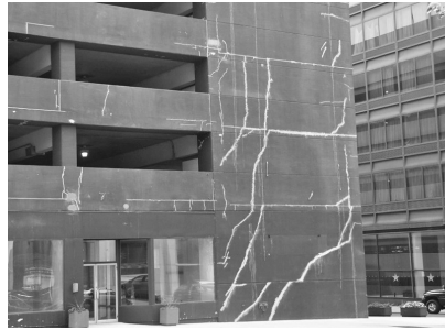
▲ Shear cracks riddle the exterior wall of this urban parking structure.