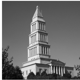
▲ Washington Masonic Memorial , Alexandria, Virginia, Earthquake Damage Evaluation.

Smithsonian Institution, Donald W. Reynolds Center for American Art and Portraiture Washington, District of Columbia Copper Roof Replacement