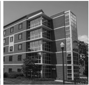
▲ Southern CT State Univ., West Campus , New Haven, Connecticut, Facade Consultation.

NYC Health+Hospitals/Kings County Brooklyn, New York Building Envelope Rehabilitation