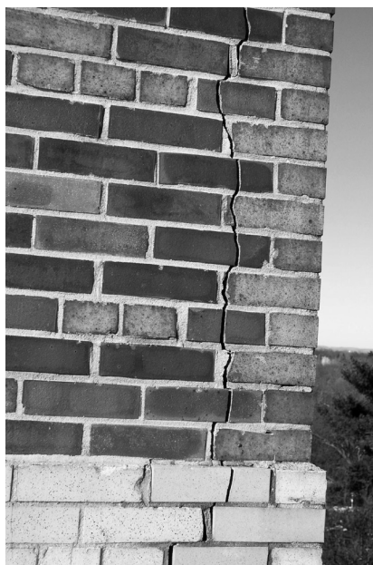
▲ If expansion joints are not provided, the building will make its own.

With attention to the causes of movement, including fluctuations in ambient temperature and moisture, applied loads, chemical interactions, and materials' propensity to expand or shrink over time, the general behavior