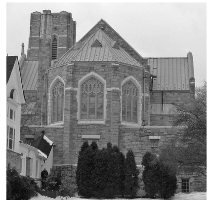
▲ Church of St. Augustine in Larchmont, New York. Copper Roof Restoration.

New York, New York Cupola and Eagle Restoration