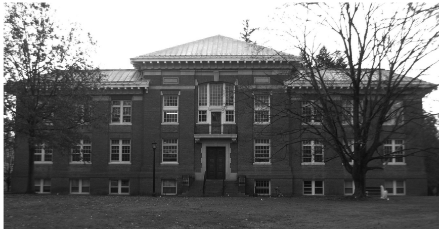
▲ Sanders Classroom Building at Vassar College in Poughkeepsie, New York. Copper Roof Replacement.

Washburn Shops Worcester, Massachusetts Cupola Restoration