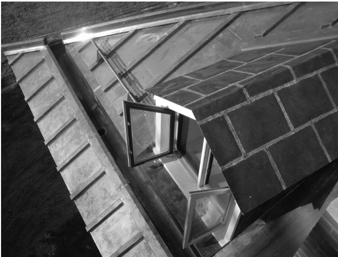
▲ Known for its striking appearance, copper is also a strong environmental choice, given its longevity, recyclability, and low embodied energy.

Examples of sheet copper roofing in Europe date to medieval times, and the first discovery of naturally pure copper can be traced to Neolithic peoples around 8000 B.C. Saint Mary's Cathedral at Hildesheim has a copper roof said to date from the 1300s. In America, copper mining began in earnest in the mid-1700s, with copper derived from Maryland and New Jersey and, a century later, from Michigan and points west.