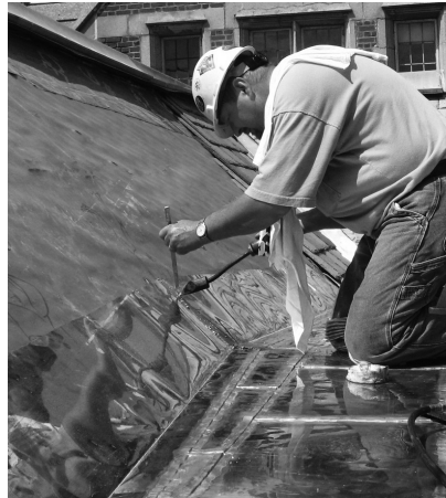
▲ Application of lead-tin solder to a flat-seam copper roof.

Solder is not the solution to all copper repair problems, however. Because the coefficient of expansion for lead-tin solder is different from that of copper, solder used to fill stress cracks will eventually break away. If cracking and metal fatigue are widespread, it may be time to consider roof replacement.