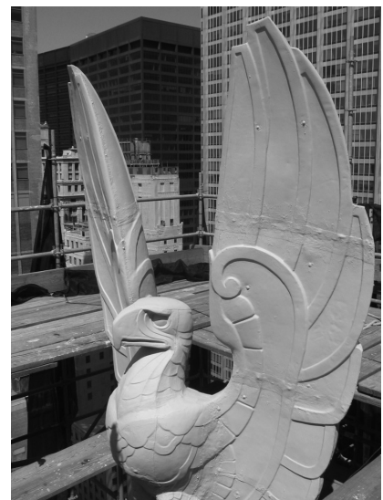
▲ Beyond roofing, copper is also used for ornamentation. Restoration of this copper eagle atop a 1929 high-rise involved off-site and on-site repair, cleaning, and reconstruction.