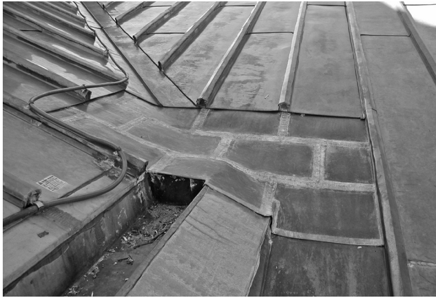
▲ Unusual conditions, such as this combination of soldered flat-seam roofing with steep-slope batten-seam, demand customized designs.

cold-rolled copper coated on both sides with lead, is used for roofing and flashings. Development of lead-coated copper was prompted by the desire for roofing and flashing material with the appearance and properties of lead, at a lower cost and with less weight. Lead-coated copper