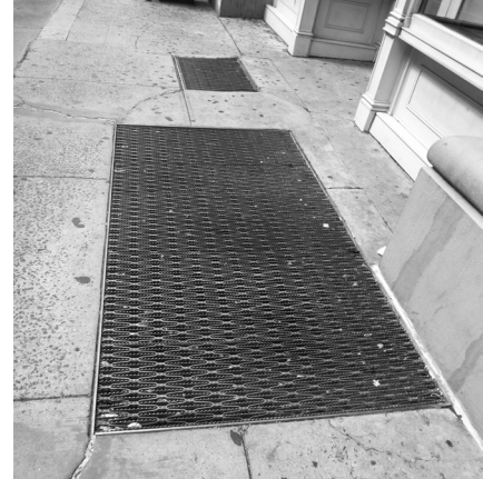
▲ Falling into a faulty grate is a real concern.

Although it's true you'd be more likely to be hit by a car than fall into a sidewalk grate, a “better safe than sorry” approach might be prudent, given how commonplace deferred maintenance can be. Just as you wouldn't step in front of a moving car even if you had the right of way, it's probably not a bad idea to avoid traversing flimsy metal mesh over a two-story drop. Our engineers will not walk on these grates. Now that you know what the engineers know, you might want to join them in taking the long way around – just in case. ■