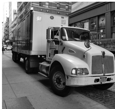
▲ Delivery trucks on sidewalks may add weight beyond what historic vaults can bear.