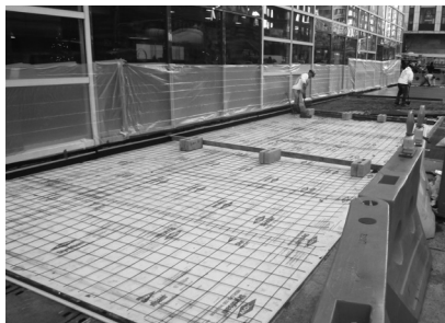
▲ The new concrete sidewalk is poured over the insulation.