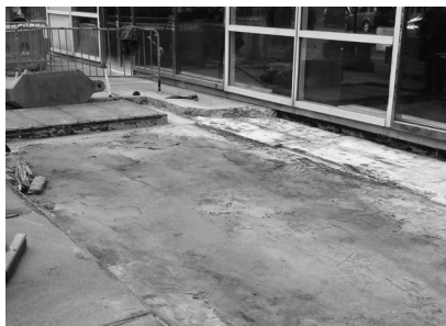
▲ First, the concrete wearing surface is removed to expose the concrete vault.