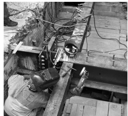
▲ Replacing or reinforcing structural steel may be necessary for today's traffic loads.