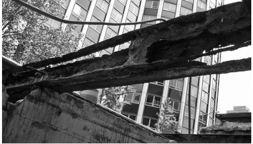
▲ At street level ( top left ), the sidewalk appears to be in good condition. In the vault below ( bottom left ), masonry arches show their age but seem structurally stable. Masonry removal, however, shows how badly deteriorated the embedded steel really can be ( above ).

creating a “vault,” was common in many metropolitan areas, especially in industrial neighborhoods. Vaults permitted delivery, particularly of coal, and access to utilities without disturbing building operations. For use of the vaults, cities like New York taxed building owners, who were expected to properly maintain the structural and weather integrity of the below-grade spaces, as well as the sidewalk surface. As the use of coal phased out, many building owners elected to stop using the vaults to avoid paying the vault tax, and, thus, the maintenance of vaults was forgotten.