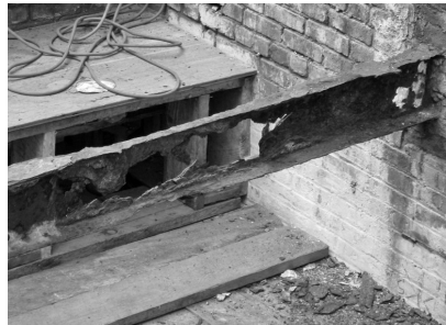
▲ Removal of masonry arches uncovers severely deteriorated structural steel beams.