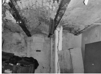
▲ Masonry arches with steel beams comprise the sidewalk vault structure.