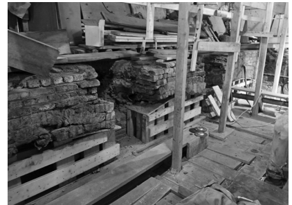
▲ Temporary stabilization of brick masonry permits replacement of deteriorated steel.

code, supplemental structural support may be necessary.