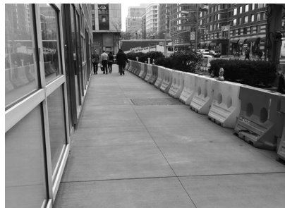
▲ The completed sidewalk system protects against water infiltration into the vault below.