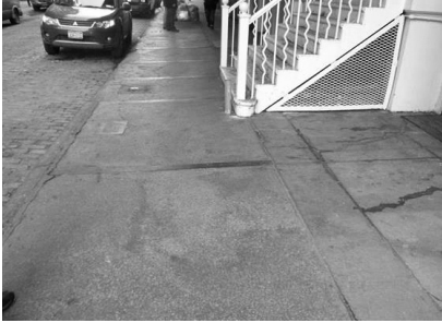
▲ Massive granite paving slabs typify sidewalk construction in historic SoHo, New York.