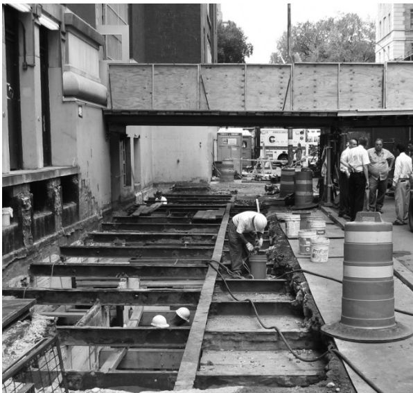
▲ Discovering and remediating sidewalk vault deterioration is crucial to preventing a dangerous collapse.

Extending the building basement beneath the city-owned sidewalk,