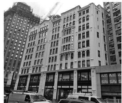
▲ Open Society Foundations, New York, New York, Sidewalk Vault Rehabilitation Design.