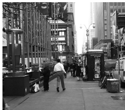
▲ Paramount Plaza, New York, New York, Pedestrian Tunnel Leak Investigation.