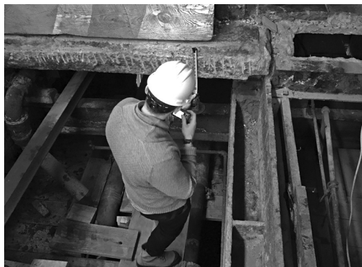
A An engineer investigates structural slab conditions at a partially deconstructed sidewalk vault.

Even for those sidewalk vaults in reasonably sound repair, structural capacity may not suffice for the demands of today's live loads, including fire engines and delivery trucks. Sidewalk vaults that are regularly accessed by maintenance workers, including spaces housing electrical, mechanical, and telecommunications equipment, can pose health hazards if water infiltration