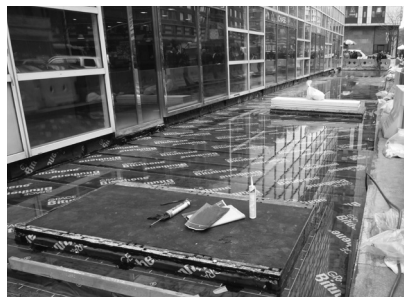
▲ After installation of new waterproofing, flood testing confirms water-tightness.