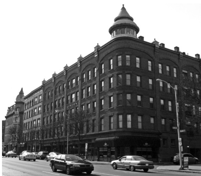
▲ One Linden Place, Hartford, Connecticut, Electrical/Boiler Room Vault Rehabilitation.

101 Barclay Street New York, New York Sidewalk Replacement and Waterproofing