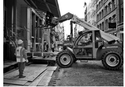
▲ Historic granite slabs are retained for reinstallation after vault rehabilitation.