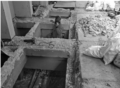
▲ Concrete sidewalk and slab are removed to access the vault below.