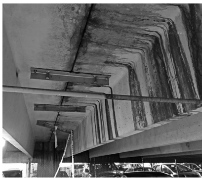
A Connection failure at this precast concrete deck led to leaks, requiring supplemental support

Precast members are cast in a factory and must be moved and assembled in the field, which means that precast decks have a far greater number of joints than their cast-in-place counterparts. Each time a car traverses one of these joints, the connections undergo stress reversals from the up-and-down motion. After millions of these reversals, the welded steel connections along the joint may become fatigued, and the joint “unzips” along its length as connections fracture. As