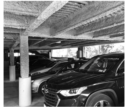
A Fireproofing coats this steel-framed parking garage with composite deck.

Information about the configuration and condition of precast concrete connections provides the design professional with an understanding of the seriousness of the structural distress. Stable, intact connections are essential to the integrity of precast concrete