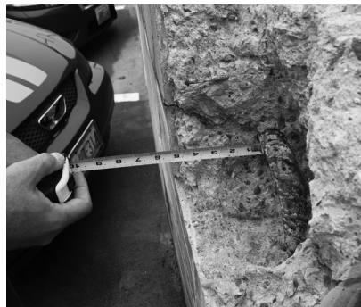
Probe to assess embedded reinforcing steel.

The assessment also provides timelines for re-inspection, which is important to monitoring conditions that do