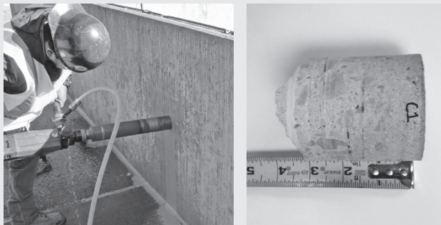
▲ Extraction of concrete cores for testing is important to evaluating the composition and quality of the material.

Half-cell potential testing: Determines the electrochemical properties of embedded steel by measuring its electrical potential. The greater the difference in charge from one point on the steel bar to the next, the greater the risk that corrosion is occurring. Requires removal of the concrete cover over reinforcing, to access the steel bars.