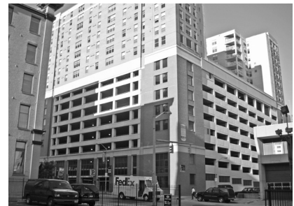
▲ Parking Authority of Baltimore City, Baltimore, Maryland, Assessments of 8 Garages.

Burlington, Massachusetts Parking Garage Investigation