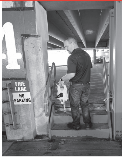
▲ The author on site to assess conditions at a hospital parking garage.

For more information, see the New York State Fire Marshals & Inspectors Association announcement, http://www.nysfma.org/parking-garage-inspections/ , or the New York State Building Standards and Codes announcement, https://www.dos.ny.gov/DCEA/pdf/2018-12%20Final.pdf .