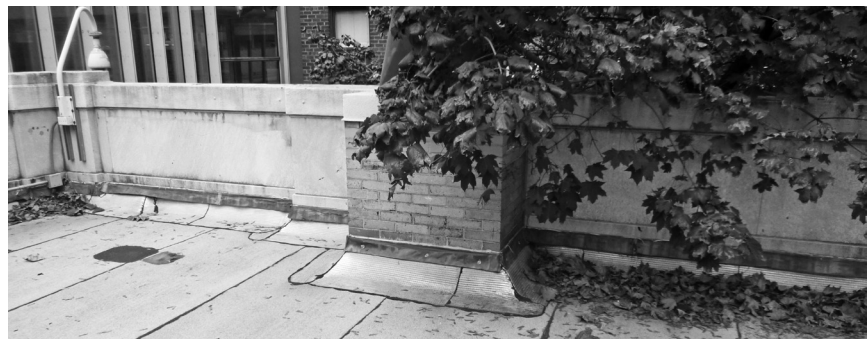
▲ Cleaning up debris, clearing drains and gutters, and repairing damage from severe weather events are important maintenance measures, even for new roofs.

Roofs must be designed to divert water from the structure. Drains prevent the ponding of water on the surface of the roof to avoid overloading the structure. Gutters and downspouts are similar, in that they transport water from the roof, away from the building's facades and foundations. A roof's drainage system must be properly designed and installed to prevent damage and deterioration of the roof system and structure. In addition, it is vitally important that drains, gutters, and downspouts be cleaned regularly to prevent the back-up of debris and sediment. Clogged drains and gutters can result in leaks below the roof and behind walls.