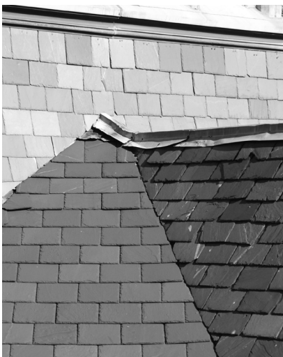
▲ Pay attention to flashings, which can fail well before the roof needs replacement.

One would assume that the more insulation on a roof, the better it will perform. In fact, insulation beyond what is required can work in concert with the building's moisture drive to trap moisture under the roof and result in significant damage. Trapped moisture may cause a roof to warp or rot and can also allow for mold growth. Added insulation also impacts flashing and curb heights, and the increased weight of materials may pose structural concerns. The roofing design professional can review applicable building and energy codes to provide the proper amount of insulation.