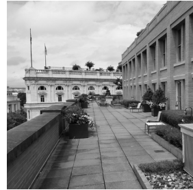
▲ 1001 Pennsylvania Avenue , Washington, District of Columbia, Roof Replacement.