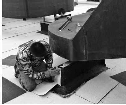
▲ Roof installation should be done only by manufacturer-certified contractors.