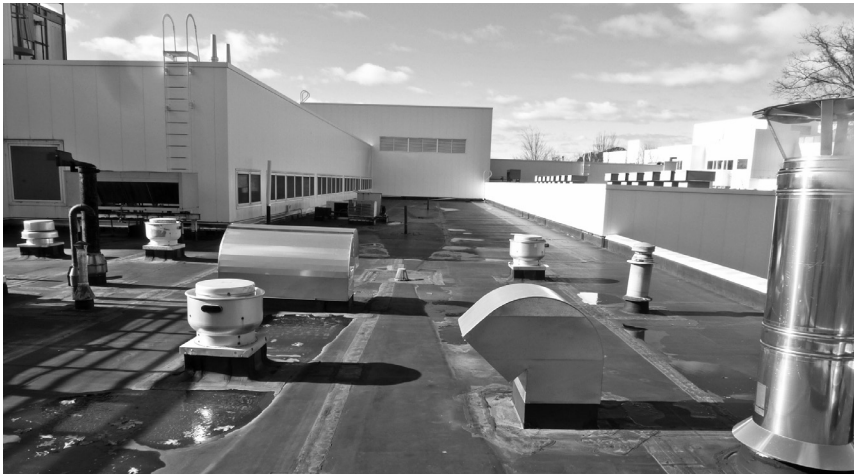
▲ A design professional should evaluate existing conditions and determine whether a proposed new roof assembly is compatible with the building construction, climate, and wind zone.