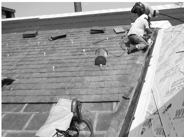
▲ Details for penetrations, flashings, ridges, valleys, drainage, and other key components should be entrusted to an architect or engineer experienced with the specified assembly.

The first decision to make in the reroofing process is whether to tear off the existing roof and start from scratch, or to leave the old system in place and lay the new one on top. The