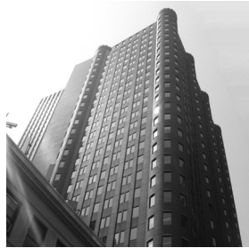
▲ Federal Reserve Bank of New York , New York, New York, Roof Replacement.

New Haven, Connecticut Hopkins House Slate Roof Replacement