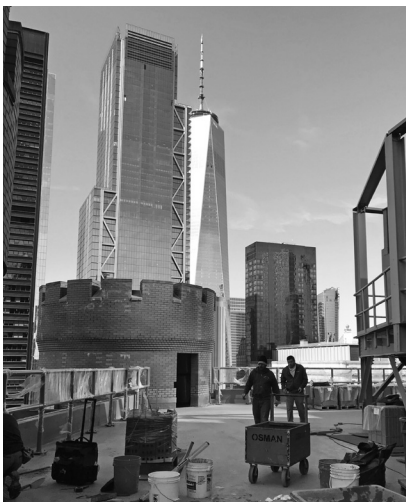
▲ Not every roof is right for every building, so finding the best suited system is critical.

flashings. Failure to regularly inspect and maintain a roof can result in leaks, which may, in turn, void a warranty. Many warranties require yearly inspection and the regular performance of repairs to remain in effect.