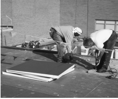
▲ Too much insulation can trap moisture and overload the building structure.