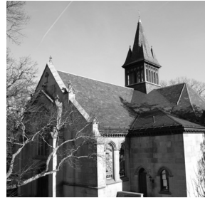
▲ Wellesley College, Houghton Chapel , Wellesley, Massachusetts, Slate Roof Survey.