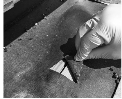
▲ Recovering an old roof with a new one requires a sound roof deck.

best results are gained from complete replacement, as this not only eliminates the possibility of trapping moisture in the old system, but it also allows for a thorough inspection of the roof deck. Before the new system is installed, any deterioration in the substrate, such as rusted steel or spalled concrete, can be remedied.