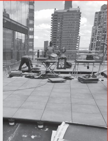
▲ Installation of a roof terrace with bituminous waterproofing membrane, board insulation, and pavers-on-pedestals.

Planting areas subject to high wind loads are vulnerable to