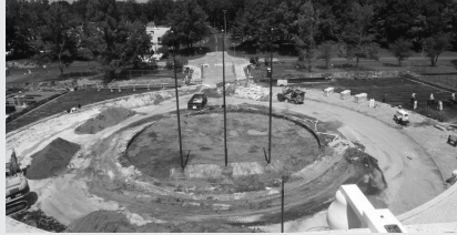
▲ Site preparation.