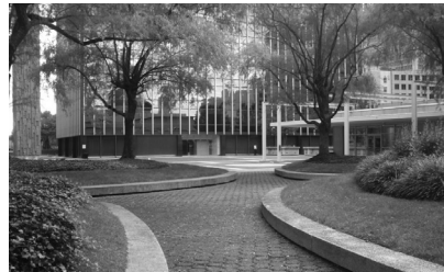
▲ Constitution Plaza , Hartford, Connecticut, Plaza and Garage Rehabilitation.

United States Capitol Complex O'Neill House Office Building Washington, District of Columbia Plaza Rehabilitation