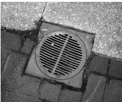
▲ Area drains provide bi-level drainage, at both surface and membrane levels.

In order to improve access across a site or to parking areas or building entrances, re-grading is often part of plaza rehabilitation. A combination of stairs, ramps, and handrails can be used to address connectivity. Based on evaluation of the existing layout, a similar or equivalent experience should be provided for users of stairs and ramps. If these assemblies are part of the means of egress system, further study must be given to the occupancy load and associated egress capacity.