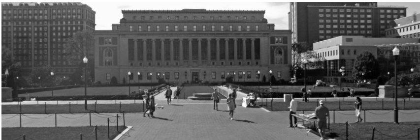
▲ Columbia University, Butler Library , New York, New York, Plaza and Hardscape Rehabilitation.

New Jersey City University Michael B. Gilligan Student Union Jersey City, New Jersey Plaza Redesign and Reconstruction