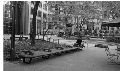
▲ Three Logan Square , Philadelphia, Penn., Plaza Investigation and Rehabilitation Design.

Stony Brook University Health Sciences Center Stony Brook, New York Walkway and Campus Underpass Rehabilitation