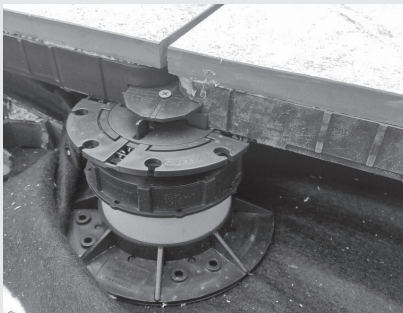
▲ Locking pedestals or fasteners may be necessary to address wind uplift and prevent paver displacement.