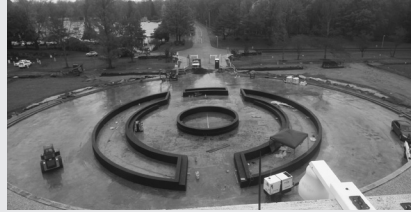
▲ Hardscape construction.