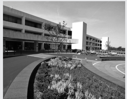
▲ Plaza at grade, with new plantings.

All new elements must be connected to the existing storm system and comply with local regulations for stormwater management. Selected drain covers should prevent detritus from entering the system and provide easy access for cleaning and debris removal from collection baskets. Finally, planters, fountains, and other unique fixed site features which could impede drainage or may require their own internal drainage must be coordinated with the overall water management design.