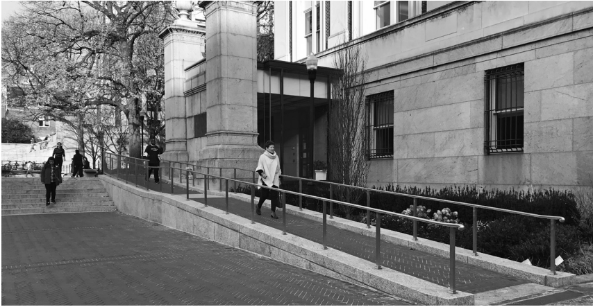
A Retrofitting ramps at historic / landmark plazas poses logistic and design challenges but is often required, both for code compliance and for universal access.

a landmark by local, state, or national jurisdictions? Are there zoning regulations; for example, is the plaza a privately owned public space? These conditions require sensitivity in the case of potential restrictions for material selection and reconfiguration.