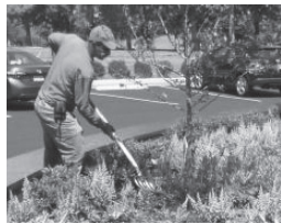
▲ Tending to plantings.