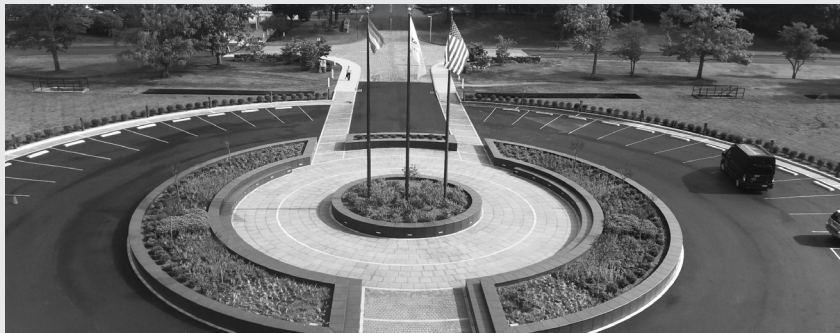
▲ Completed plaza, situated above an underground parking garage.