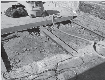
▲ To support the added load of plantings and pedestrians, existing structural framing may need to be exposed and augmented.

Despite challenges with waterproofing and structural integrity, adding plaza space provides benefits for occupants and the surrounding environment. ■