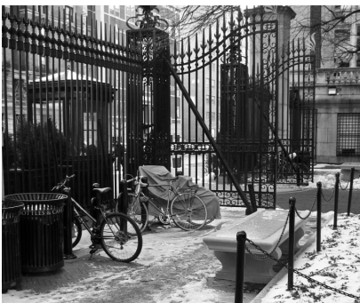
A Snow and ice management is a key consideration for plaza maintenance.

Interpret the existing arrangement of the plaza based on the identified use