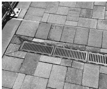
▲ Trench drains remove surface water across the entire width of a ramp or slope.