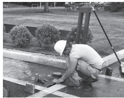
▲ Re-setting pavers.