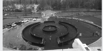
▲ Waterproofing membrane installation.