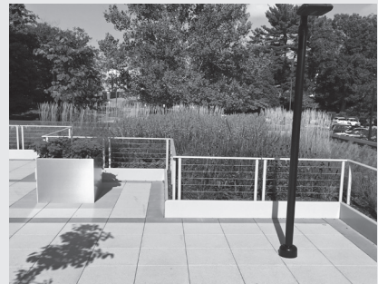
▲ Restricting pedestrian access using fencing or other barriers limits loads by keeping heavy planted areas free from traffic.

and can be finished with paint, anodized, or allowed to patinate. Similar materials are also used for infill, in mesh, perforated, or woven form, as well as glass.