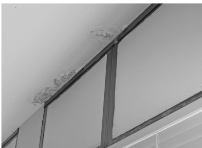
▲ Leaks and drafts.

Flashing detailing , too, requires fastidious attention to prevent leaks at intersections between the curtain wall and other building elements. Without detailed contract documents that fully describe and illustrate perimeter flashing conditions, along with coordination between the curtain wall installer and construction manager during installation, flashings may not be adequately tied or terminated, permitting water to enter the wall system.