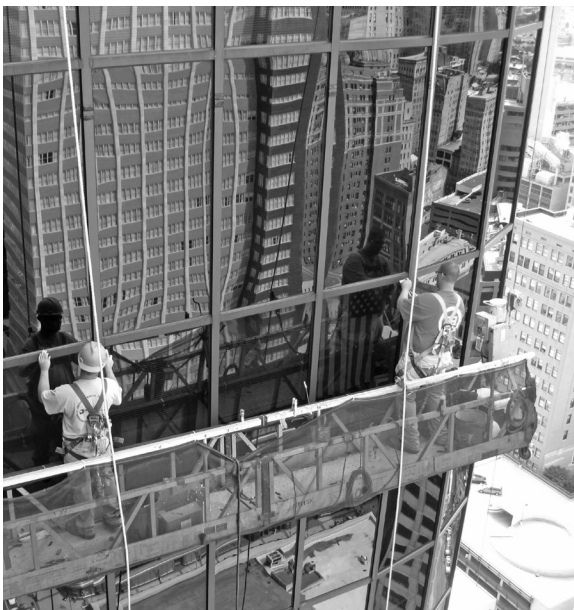
▲ Workers repair failed gaskets at a glass curtain wall high-rise.

Although curtain wall systems may incorporate a variety of materials, we will focus on the type that is so ubiquitous, it has effectively become synonymous with the words “curtain wall”: the glazed curtain wall system. Glazed curtain walls usually consist of a metal frame, often aluminum, with in-fills of vision and spandrel glass. Other materials may be interpolated between glazing units, including brick veneer, precast concrete, metal panels, and thin stone. The hallmark of these systems is a focus on