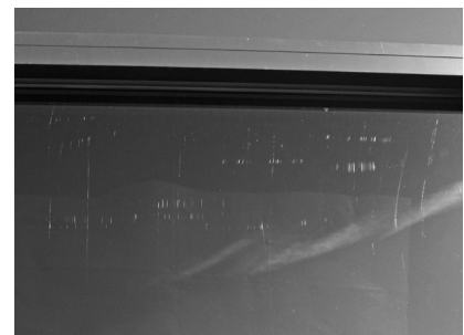
A Scratches and hairline cracks.