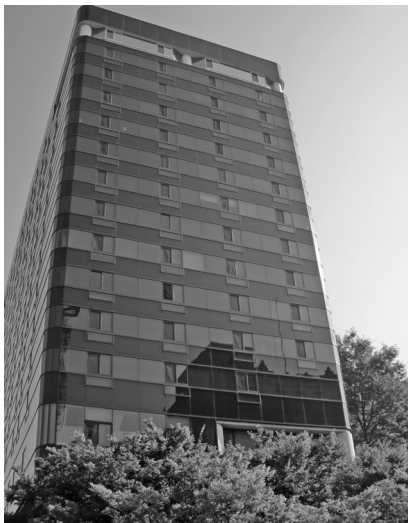
▲ The Biltmore in Stamford, Connecticut. Glass Curtain Wall Rehabilitation Design.

New Haven, Connecticut Glass Curtain Wall Rehabilitation