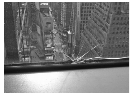
▲ Broken glass.