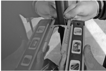
▲ Evaluation may include measurements of gasket hardness (top) and of glazing alignment (bottom).

However, before investing in facade upgrades for the sole purpose of reducing energy expenses, it's a good idea to evaluate the projected time period for cost recovery. While minor retrofits may pay for themselves relatively quickly, some major upgrades may have a protracted payback period, depending upon the existing energy profile.