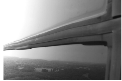
▲ Gaskets disengaged from glazing.

In an existing structure, ultrasound, laser imaging, or heat soak testing may be used to identify NiS inclusions; however, such test methods can be labor-intensive and expensive. For buildings with multiple glass failures, the pros and cons of full glazing replacement should be weighed against the costs of testing and isolated replacements.