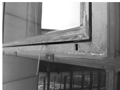
A Loose or missing weather stripping.