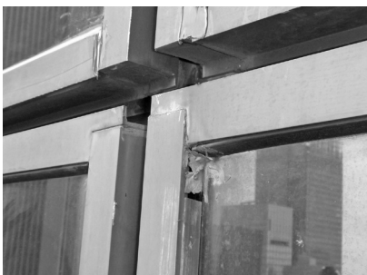
A Gaps at frame corners.

Even fifty years ago, curtain wall systems weren't as energy-efficient as was solid wall construction. With energy costs and environmental considerations now topping the list of building management concerns, retrofits that increase the efficiency of glazed curtain walls have become an attractive option for improving overall building performance.