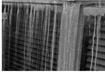
▲ Streaked glazing.