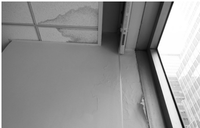
▲ Leaks and drafts.