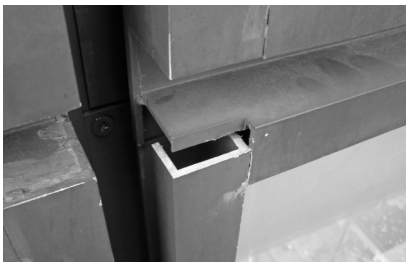
▲ Frame displacement.

a major impact not only on the energy consumption and maintenance demands of the building, but on the comfort of building occupants.