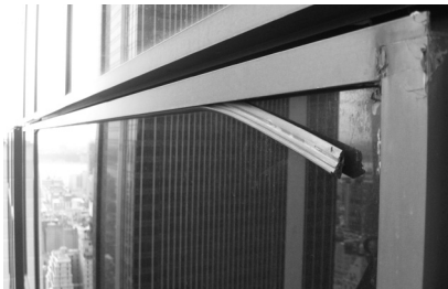
▲ Failed gaskets and seals.