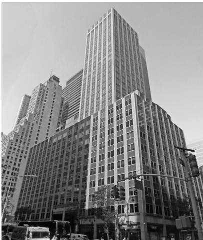
▲ TIAA Financial Services, 730 Third Ave., New York, New York, Curtain Wall Assessment and Repairs.

New York, New York Curtain Wall and Window Replacements