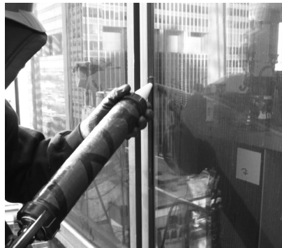
▲ Wet glazing an existing glazed curtain wall.

Once a design professional has identified curtain wall issues and evaluated their probable causes, multiple factors should be considered in the decision as to how best to address the observed problems.