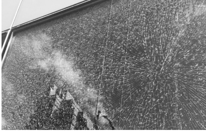
▲ Broken glass.