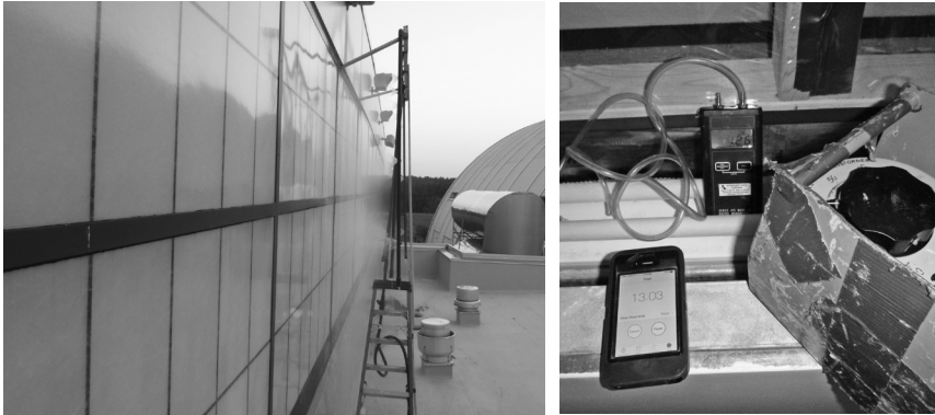
▲ Field water penetration test to investigate leaks at an existing glazed curtain wall assembly.

terms of strength. Tempered glass, the strongest of the three, is chemically or thermally treated to provide improved strength and shatter resistance.