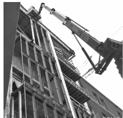
▲ Installation of a new stick-built curtain wall.