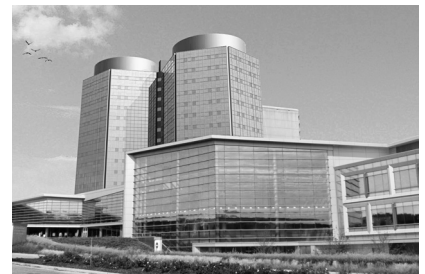
▲ Stony Brook University Medical Center, Stony Brook, New York, Curtain Wall Replacement (rendering).