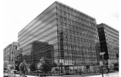
▲ CityCenterDC, Washington, District of Columbia, Facade Condition Assessment.

New York, New York Curtain Wall Investigation and Glazing Consultation