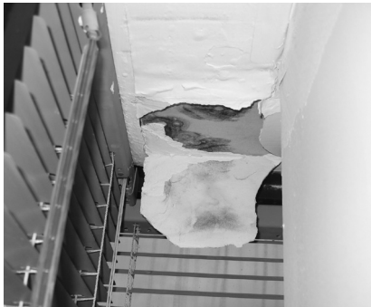
▲ Exterior investigation, rehabilitation, and expert witness services for an office complex.