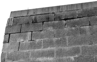
▲ Failure investigation, remediation, and litigation support at a state facility.

Sivin & Miller Suisman Shapiro Updike, Kelly & Spellacy