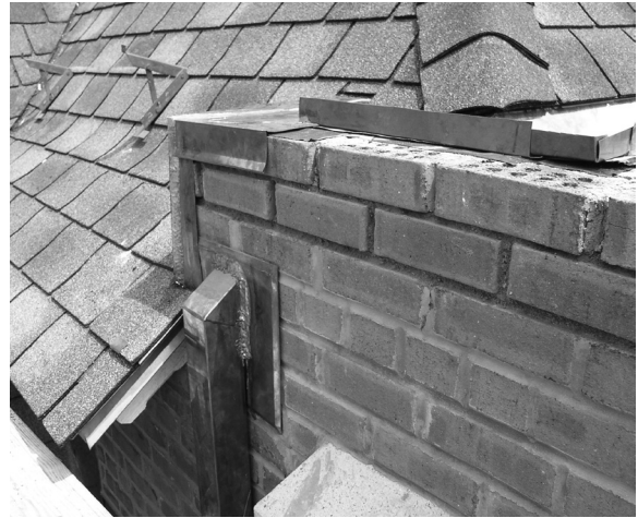
▲ Building intersections are susceptible to leaks. Paying extra attention to these vulnerable areas during construction is critical to failure prevention.

Unfortunately, though, hours spent in a courtroom or arbitration hearing don't translate into hours saved in the field. In some cases, hapless