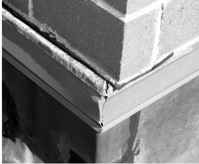
▲ Litigation support relating to roof design and installation errors at a primary school.