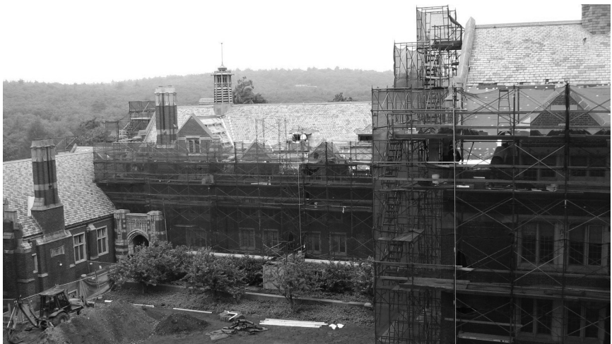
(continued from page 6)

architect or engineer might perform contractual services, but do so in a way that fails to meet the degree of care ordinarily practiced in that location and discipline.