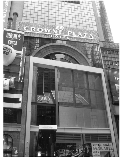
▲ When new technologies are used, owners must be active participants in the decision-making process. Pictured here, from left: a green roof at Yale University, the Smithsonian National Museum of the American Indian's undulating facade, and a Mediamesh® screen at the Crowne Plaza Times Square.

tion in professional organizations, and seeking peer input from others in the industry.