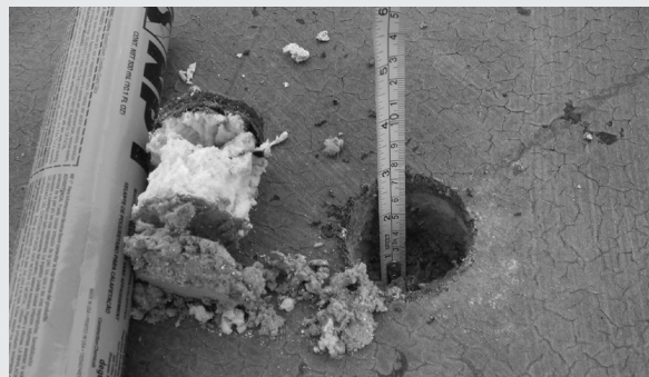
▲ Appropriate evaluation, appropriate care. Clockwise, from top left: floor load test, water penetration test, roof test probe, weld samples for laboratory analysis.