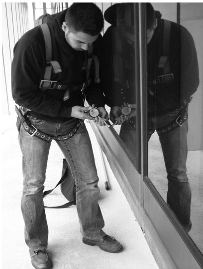
▲ Providing services consistent with common architectural practice is critical to meeting the standard of care.

but they're not infallible. That's why peer review is so important. General practice firms often engage the services of a building envelope or MEP (mechanical, electrical, and plumbing) consultant to review drawings, specifications, and construction progress, applying specialized knowledge and experience.