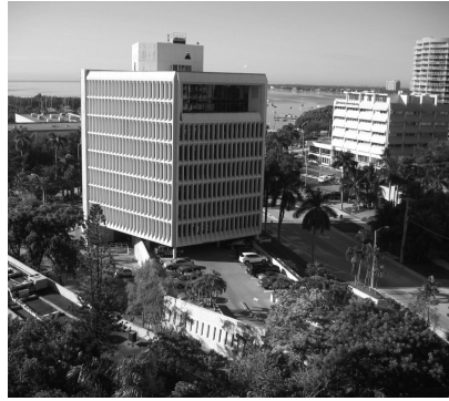
▲ A tale of two cities: the standard of care may be different in New York than it is in Miami.