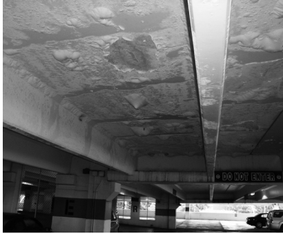
▲ Defect evaluation, remediation, and expert witness services for a hotel parking garage.