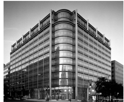
▲ 1900 K Street Office Building in Washington, District of Columbia. Storefront Revolving Door Assessment.

Building Envelope Consultation for New Construction, Including Storefront Entry