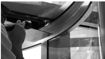
A Investigation of the poorly functioning revolving door at this office complex revealed extensive corrosion.

Conventional storefront systems are stick-built , constructed in the field from individual framing components