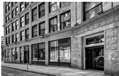
▲ Chauncy House in Boston, Massachusetts. Facade Restoration, Including Storefronts.