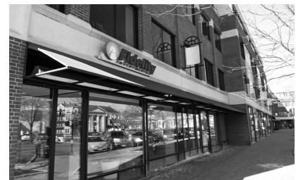
▲ Figure Eight Town Center in West Hartford, Connecticut. Storefront Consultation.