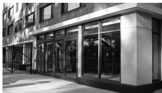
Replacement of this aging storefront ( below ) demanded modifications to the new assembly ( left ) for operation in strong wind.

When evaluating storefront design options, it is important to consider not only up-front cost, but maintenance and operation costs, as well. For example, a pivot door might be