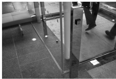
Vestibules prevent drafts and heat loss.