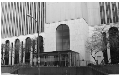
▲ M&T Bank in Buffalo, New York. Entrance Redesign and Plaza and Garage Rehabilitation.

Glazing Replacement and Facade Restoration for Storefront and Windows