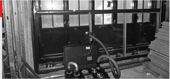
Field tests confirm the storefront meets performance standards.

Depending on the complexity of the design, the architect or engineer may recommend testing of the entire storefront system, including all components and glazing. The testing laboratory provides a basic structural skeleton, on which the contractor/installer builds the test specimen under the direction of the manufacturer. Since minor modifications are often necessary to pass the performance tests, it is important to have participation of the installer as well as all manufacturers, especially for custom assemblies involving parts from different companies.