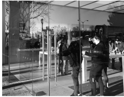
Without weatherstripping, these doors look sleek, but air infiltration may be an issue.

Particularly for historic storefronts or older assemblies suffering from deferred maintenance, it may be helpful to categorize problems by severity. Prioritizing repairs assists with budgeting, should the work need to be