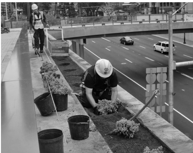
▲ Plan ahead for planter care and upkeep by installing linear fall protection lines for safety harness tie-ins.

Whether preservation, restoration, rehabilitation, or renovation, all plaza projects need to consider water management. Water is the single largest source of plaza deterioration and