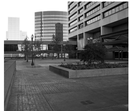
▲ Travelers Plaza in Hartford, Connecticut. Plaza Redesign and Reconstruction.

Citibank Elmhurst Financial Center Elmhurst, New York Plaza Waterproofing Rehabilitation