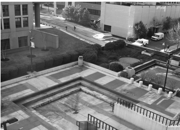
▲ Before: The under-used plaza at this public university showed signs of age and wear.