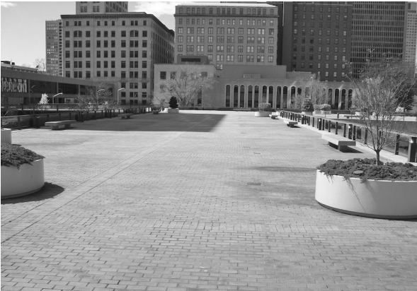
▲ Existing plaza.

Note, however, that such repurposing of plaza space requires that the new planting beds be protected from incidental use that could bring the total load above structural capacity. Installation of fences, railings, and/or gates must clearly indicate to pedestrians that green roof areas are off-limits. ■