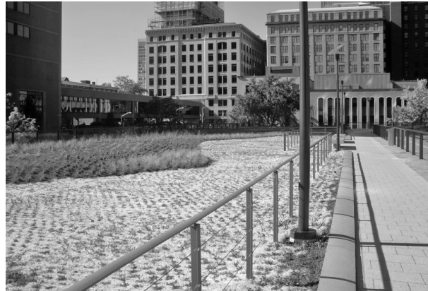
▲ After renovation of plaza to a green roof system.

premature failure, and without appropriate provision for water protection and drainage, even the most visually arresting of plazas becomes a source of ongoing problems.