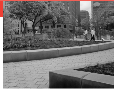
▲ Wide, faceted joints and grooves in sitting walls prevent skateboarding along the edge.

With proactive measures, the broken concrete, skid marks, and crumbling masonry that are the hallmarks of skateboard activity can become a thing of the past, without compromising safety or appearance. ■