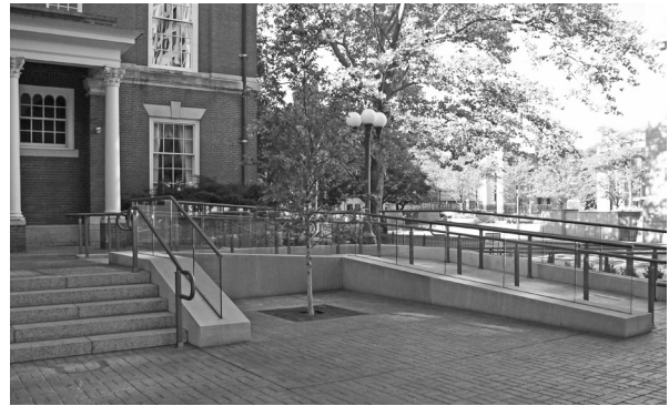
▲ Code-compliant accessibility features, like ramps and handrails, can be added to historic plazas without compromising aesthetics.

Other concerns for historic and landmark plaza restoration include availability of original materials, slip