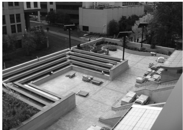
▲ After: Renovation provides varied program space that incorporates plantings, solar lighting, and durable materials.