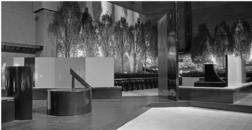
▲ Gracie Mews in New York, New York. Plaza Rehabilitation.

Woodcliff Lake, New Jersey Plaza Waterproofing and Structural Repair