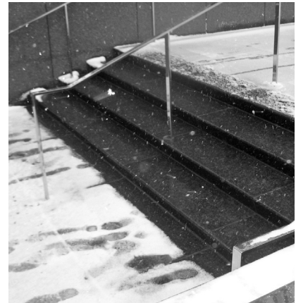
▲ A snowmelt system can ease winter storm management and improve safety.

Typically, this limitation is not a problem for plazas. Because the weight of extensive green roofs is comparable to that of many plaza paving systems, ounce-for-ounce replacement of pavers with plants and growing media is often possible. In addition, plazas must be designed for large potential live loads from vehicles and crowds; once converted to a green roof, that area must sustain only