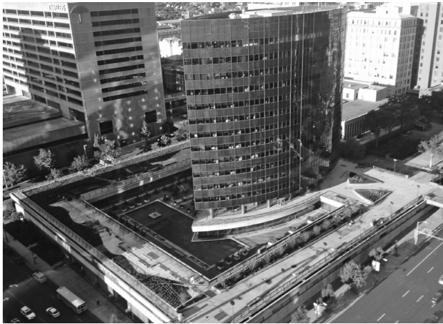
▲ A plaza project offers the opportunity to enhance the stature of a property and raise its value to the community.

According to The Secretary of the Interior's Standards for the Treatment of Historic Properties , "preservation" is the process of sustaining the form, integrity, and materials that define the overall historic character of a property.