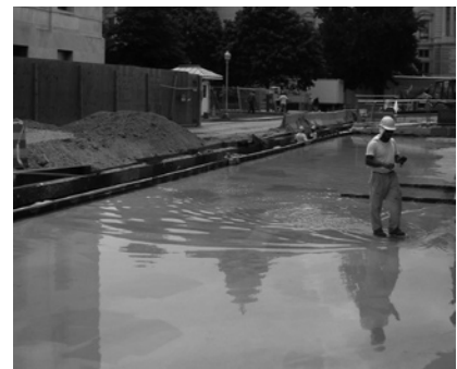
▲ Flood test of waterproofing on rehabilitated deck.