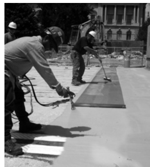
▲ Application of deck waterproofing with reinforcing fabric.