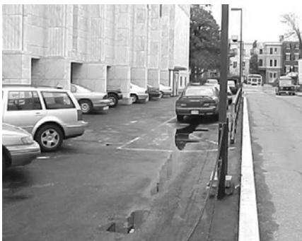
▲ Below-grade vault is under parking deck.