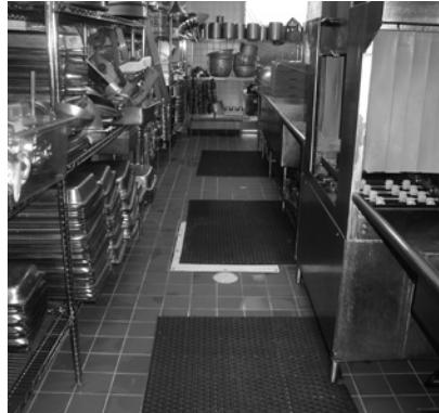
▲ Dishwashers and other kitchen equipment introduce a high-volume water source with a high potential for leaks.

Oversight and review during construction by an owner's representative is an essential part of the quality control process. Should site conditions differ unexpectedly from design documents, or unforeseen circumstances present themselves, an on-site architect or engineer can respond to last-minute changes without delaying the construction schedule. The design professional can direct the general