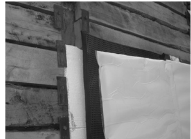
▲ Blind side waterproofing sheet with drainage composite, installed prior to concrete.

Waterproofing: A system that may include coatings, membranes, drainage media, perimeter drainage, interior channels, sump pumps, or other elements, designed to prevent and manage water infiltration.