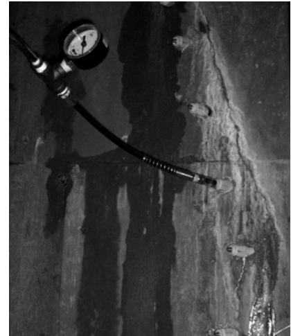
A Negative side waterproofing injection via ports along a foundation wall crack. Gauge monitors pressure of injected resin.