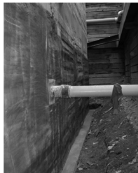
▲ Spray-applied liquid waterproofing.