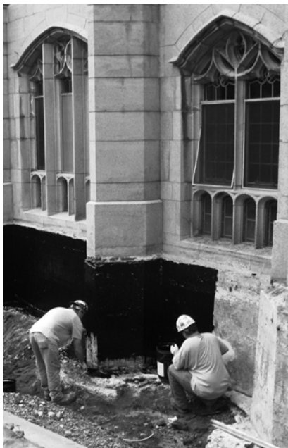
▲ Once below-grade waterproofing is buried, leaks due to faulty application can be difficult to resolve.

Impervious membranes are one critical component of waterproofing, both for below-grade applications, such as foundation walls, basements, tunnels, and vaults; and for areas subject to high moisture levels, like fountains, lobbies, kitchens, and mechanical rooms. Waterproofing membranes may be applied in one of two ways: positive side and negative side .