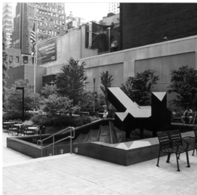
▲ Fountains demand extra attention to waterproofing detail, especially when over occupied space.