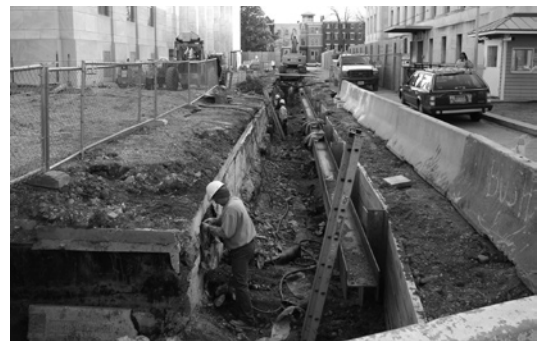
▲ Excavation to expose vault and deficient waterproofing.