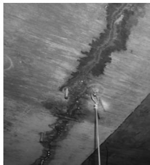
▲ Leaks at underside of deck.