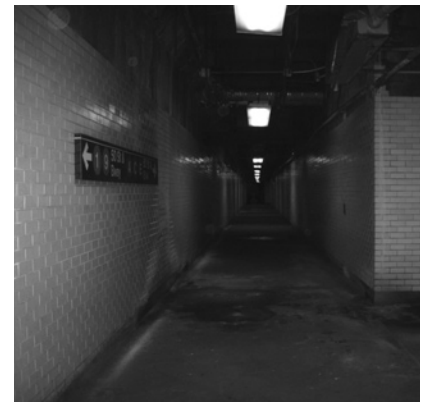
▲ Pedestrian tunnels offer convenient access, but their location under busy areas makes waterproofing particularly challenging.