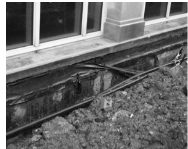
▲ Positive side waterproofing defects, viewed during repair excavation.