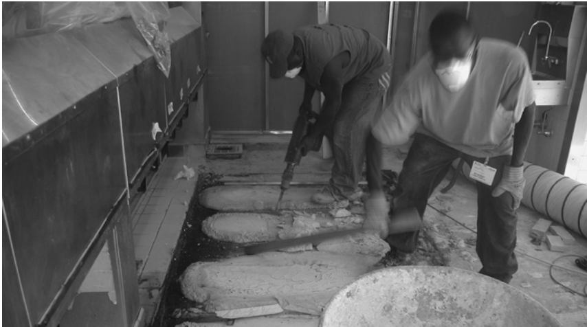
▲ Suspending kitchen operation for waterproofing rehabilitation is hardly desirable. But if leaks are ignored, water damage to structural systems and finishes will only make things worse.

tendency and run downhill, into the deeper below-grade space. Transitions such as these demand extra attention to detailing and construction sequencing to prevent failures.