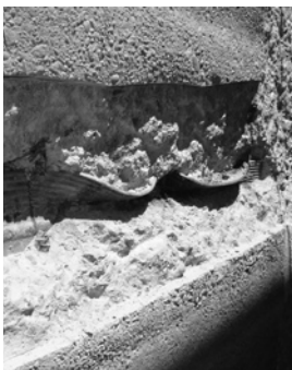
▲ Bent water stop in vault wall.

In cases where unusual intersections, multiple penetrations, or differential pressures demand elaborate detailing, designers are sometimes guilty of leaving these vital junctions to the discretion of the contractor. Where a waterproofing construction team has had success with similar configurations in the past, this may not cause a problem. But in the more likely event that the general contractor is facing an unusual arrangement that demands sophisticated design, relying on standard details is probably not sufficient.