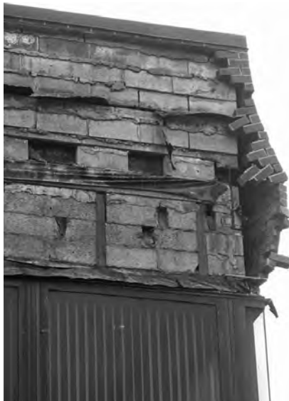
▲ Unless the problem is correctly diagnosed and repaired, it will continue to worsen, sometimes to the point of major failure.

Building materials expand and contract at different rates. Brick, for example, expands over time, whereas concrete shrinks. In this fairly typical cavity wall construction, the brick masonry is only a one-brick-thick veneer. Behind it is an open cavity space to allow for drainage, along with insulation and an air/vapor barrier. On the other side of this cavity is concrete masonry back-up, which provides the structure of the wall; unlike solid brick masonry