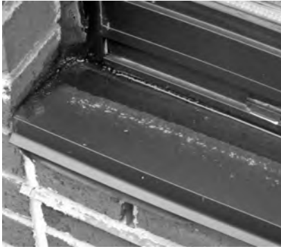
▲ Figure 1a: Masonry expansion led this sill to bend upward at the front edge.

construction used in historic structures, newer buildings use brick only at the wall surface.