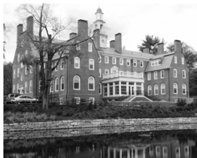
▲ Choate Rosemary Hall, Archbold Building in Wallingford, Connecticut. Facade Rehabilitation.

Fairfield Public Schools Fairfield, Connecticut Building Envelope Master Plan and Rehabilitations