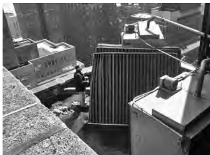
❑ Figures 8a (top), 8b (middle), 8c (bottom): A portion of this glazed curtain wall detached and fell dozens of stories.