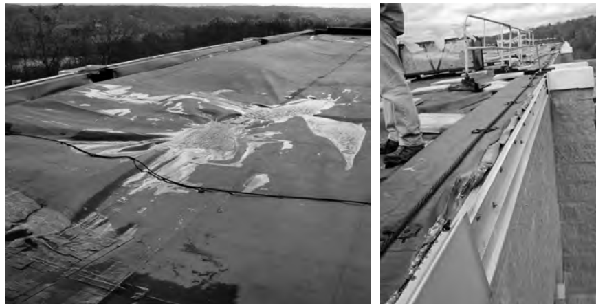
▲ Figures 6a (left) and 6b (right): Roof blow-off caused by insufficient insulation adhesion, poor edge detailing, and other construction defects.

Based on notes made on the original drawings, we surmised that the ice