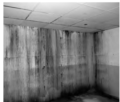
▲ Figure 3c: The plaza looked great, but leaks left rooms below looking anything but.