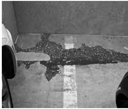
▲ Figures 5a (left) and 5b (right): Insufficient air entrainment of this concrete surface left freezing moisture no room to expand, leading to severe disintegration.

More concerning, the fractured welds, combined with the missing concrete and loss of embedment area at the beam flanges, mean that the connection capacity at many of the intersections between precast units was significantly compromised. Although the distinctive reddish-brown rust stains and chipped concrete are obvious indicators of, at a minimum, a maintenance issue, what they don't immediately reveal is the serious nature of the damage from a structural standpoint.