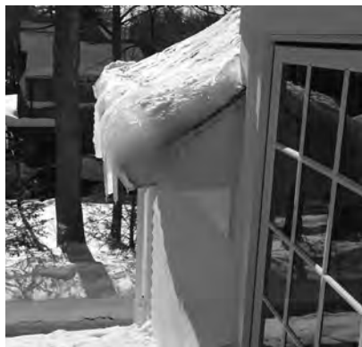
▲ Figures 7a (top) and 7b (bottom): Ice dams at eaves led to extensive leaks at the building interior and required replacement of the roof just a few years after it was installed.

interviewed the curtain wall manufacturer to complete the picture of the probable cause of failure. Constructed in 1962, the curtain wall system employed a series of bolts and clips to secure the framing to the building structure. Newer curtain wall buildings use locking nuts to counteract vibration, but in buildings of this vintage, nuts and bolts working loose was not uncommon, even when some type of lock-washer was used. During the investigation, we found enlarged holes on some outrigger clip connections, which was consistent with fastener loosening.