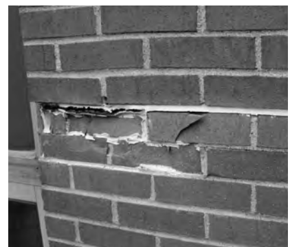
▲ Figure 2b: An attempt to fix spalled brick with sealant made matters worse.

As the outside temperature rose and fell, trapped water underwent successive freeze/thaw cycles, expanding as it froze and contracting as it thawed. These changes in temperature and pressure forced off pieces of the outer surface of the brick, and led to the displacement visible in Figure 2a, in which the face brick is nearly detached from