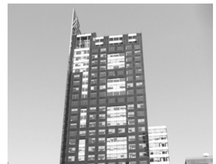
▲ Bertelsmann Building, 1540 Broadway in New York, New York. Glass Curtain Wall Investigation and Repair.

Folger Shakespeare Library Washington, District of Columbia Exterior Rehabilitation