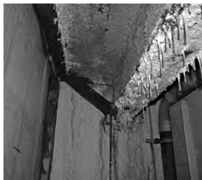
▲ Figure 3b: Plaza leaks corroded steel and melted fireproofing beneath the faulty joint.