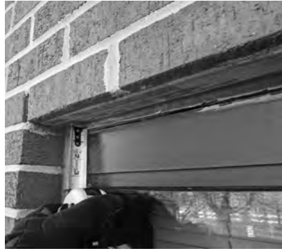
▲ Figure 1b: As the brick veneer expanded, it pulled upward away from the window.

Unfortunately, this building was designed without relieving angles or horizontal expansion joints. Although there are other ways to accommodate movement, these are limited to low-rise buildings, and no such provisions were made here. As a result, the cumulative expansion of all of the brick masonry over the entire four-story building led to substantial differential movement, particularly at the top floor, where the brick had expanded so much that the window sills were now sloped inward, toward the window, allowing water to collect along