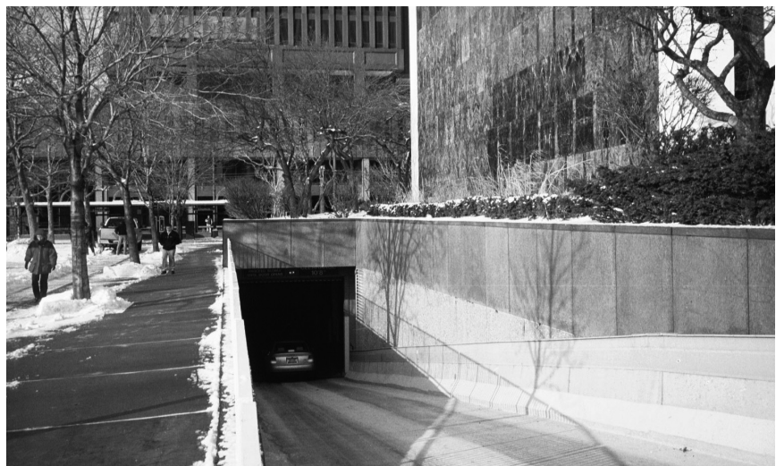
▲ One M&T Plaza in Buffalo, New York. Investigated and resolved chloride-induced corrosion at parking garage and plaza.

New York, New York Addressed differential settlement due to freeze/thaw cycling at plaza; remediated leaks and deterioration at facade