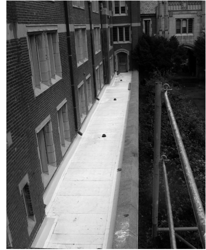
A Properly designed roof.

a Winterizing Program document that you can use to collect and store information on maintenance evaluations, planning, repairs, and methods. Record your observations about roof conditions, using photographs and sketches, and list needed repairs so that these can be scheduled and completed before the cold weather.