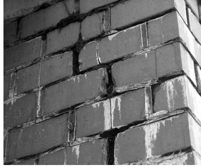
▲ Cracks and eroded mortar compromise resistance to ice, snow, and changing temperatures.

If you have ruled out drainage and water penetration problems, but large concrete members continue to show surface moisture, then you might have a simple case of seasonal condensation. Make observations during different weather conditions; condensation is likely to appear when weather heats up quickly, as during an unseasonably warm winter's day or early spring thaw. There may be little that can be done about the problem, however, as it is simply the nature of a large mass to warm up more slowly than the surrounding air, leading to water