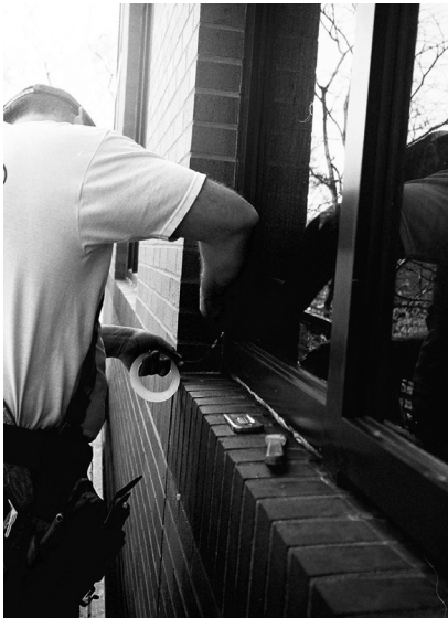
▲ Seal doors and windows well ahead of winter weather.

If you do not already keep a maintenance and repair record, establish