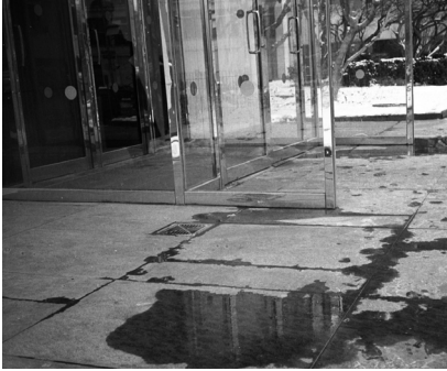
▲ Fix drainage problems promptly , before icy patches create liability risks.

there, or to move it to a single area of the parking deck, which would then be closed to use. If the latter is the case, then be sure that the structure can accommodate the load of the mounded snow.