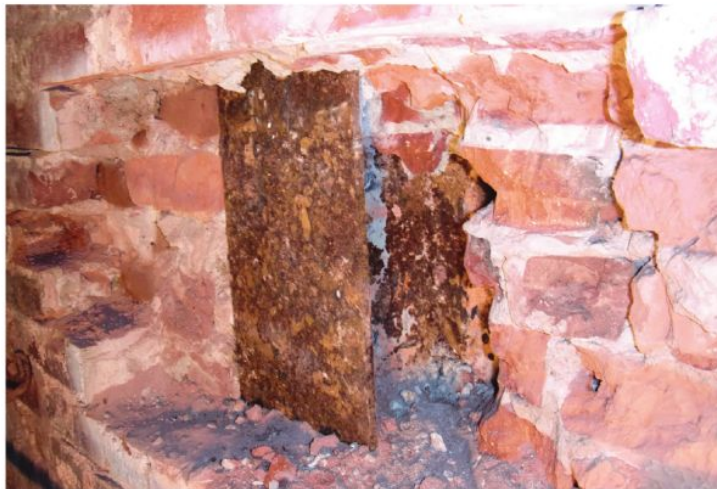
Invasive probes can reveal concealed problems, such as corroded structural steel.

areas slated for repair. By helping pinpoint the nature and extent of problems, the maintenance team can guide the architect or engineer in creating project cost estimates better in line with the true nature of the issue.