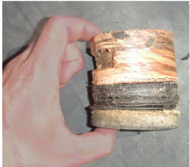
Test cores may be used to evaluate conditions within a roof assembly.

Even in cases where original documents and drawings illustrate the composition of the exterior wall assembly, as-