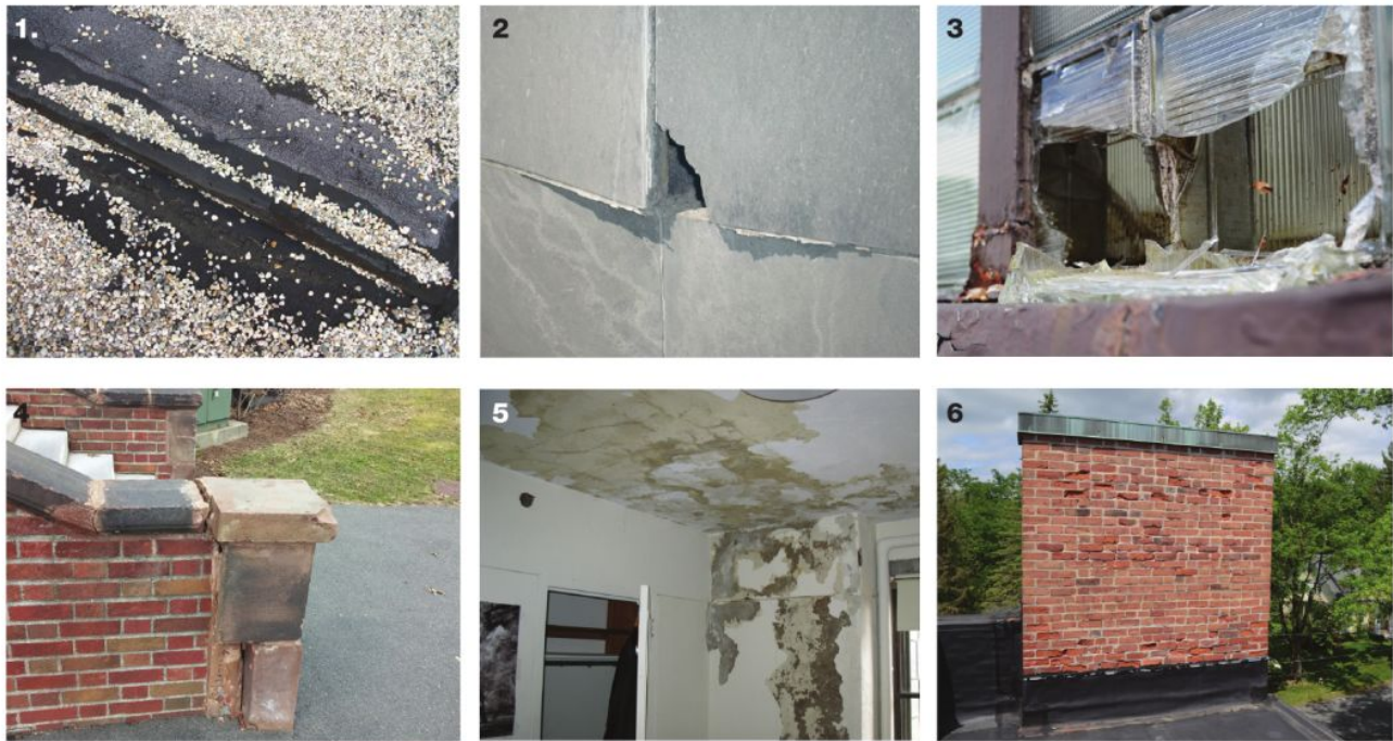
Sample conditions observed during a building envelope assessment of nearly 60 buildings on the urban university campus pictured on page 60 led to a long-range maintenance and rehabilitation master plan. Shown are examples of deteriorated roof membrane (1), displacement and fracture at stone façade (2), shattered glass-block windows (3), site wall and exterior stair damage (4), interior finish damage from roof leaks (5), and spalled brick masonry at a chimney (6).

To evaluate the performance of building envelope elements under different climate conditions, it is beneficial to conduct observational site visits at different times of the year. An investigation in the spring might pick up on cracked foundation walls that would be concealed by snow later in the year, but would miss ice damming or condensation only present during the winter.