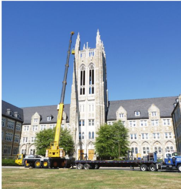
Close-up investigation may be aided by lifts, drops, or other observation platforms.

An executive summary can distill these recommendations into key objectives aimed at highlighting significant findings and establishing facility management priorities for both immediate needs and the long-term health of the facility.