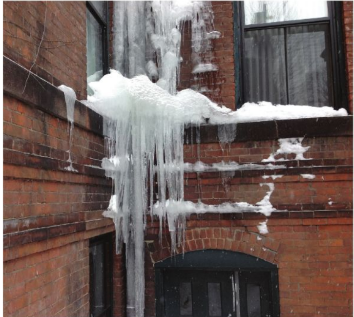
Conducting assessments in different seasons permits observation of varying weather-related conditions on multi-building campuses.