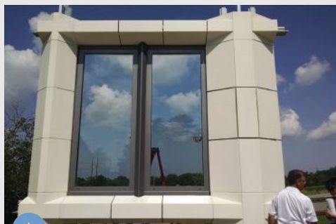
Mock-ups provide a representative sample to evaluate design and performance.

In short, a manufacturer's published data provides an overview of a wall or roof assembly's performance, but it is no substitute for independent verification testing. Pre-construction VMU testing establishes design parameters, while in-situ PMU testing during construction, for issues such as air and water resistance, provides validation that the system meets performance requirements.