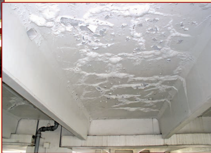
As water penetrated down through this elevated slab, it caused bubbling of the applied coating.