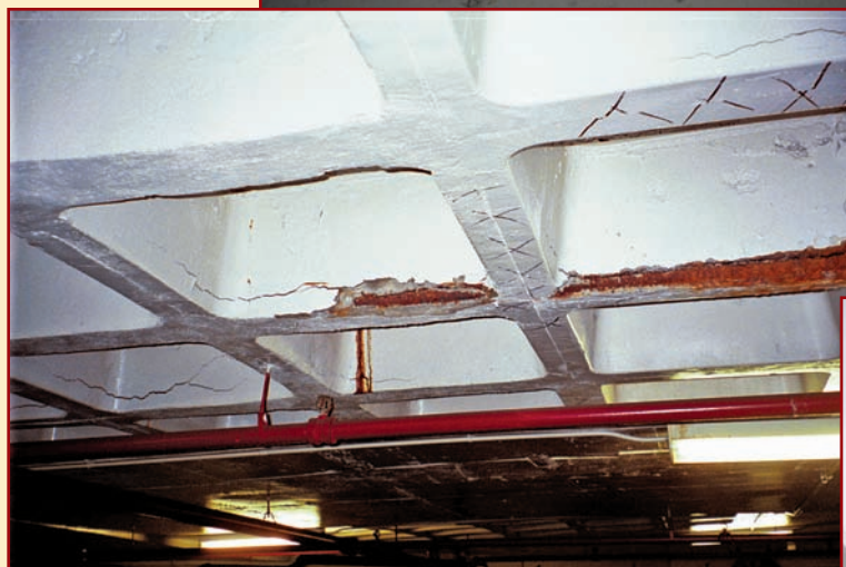
Surface spalling on an elevated deck may be a sign of trapped moisture.