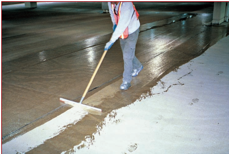
Figure 3 – Applying a low-cost sealer to a concrete deck can be a quick, effective, low-maintenance option.

Until such time as the super-rigid elasto-epoxythane traffic-resisting armor is developed, we will have to settle for the solution of selecting the best of the available sur-