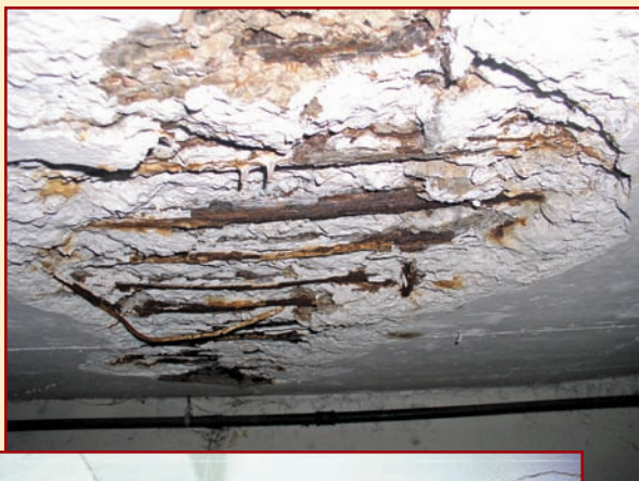
Severe concrete deterioration at the coated underside of a parking deck.

As the adage goes, location is everything. Knowing which surfaces in a parking structure can accept an impermeable coating and which are best left bare is critical to prolonging the life of your garage.