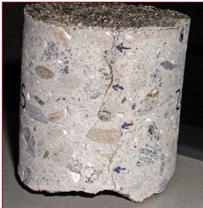
Figure 5 – Test core showing epoxy penetration to the bottom of a crack.

Consequently, protective techniques tend to focus on these moving cracks. If cracks are few and the deck is chloride-free, then routing and sealing cracks and applying