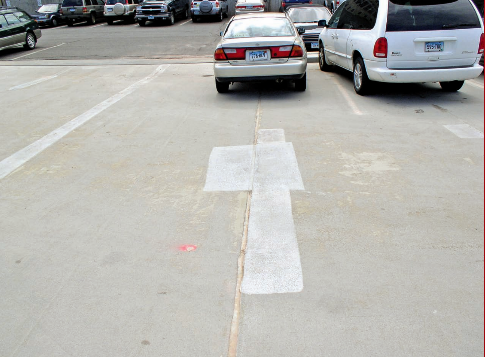
Figure 6 – Edges of pre-cast concrete units at sealant joints catch snowplow tips, quickly wearing away surface treatments. Here, coating patches were used as a temporary fix.

a low-cost sealer may be appropriate. If the deck is riddled with cracks that can't be adequately sealed, then elastomeric membranes begin to look like a good option.