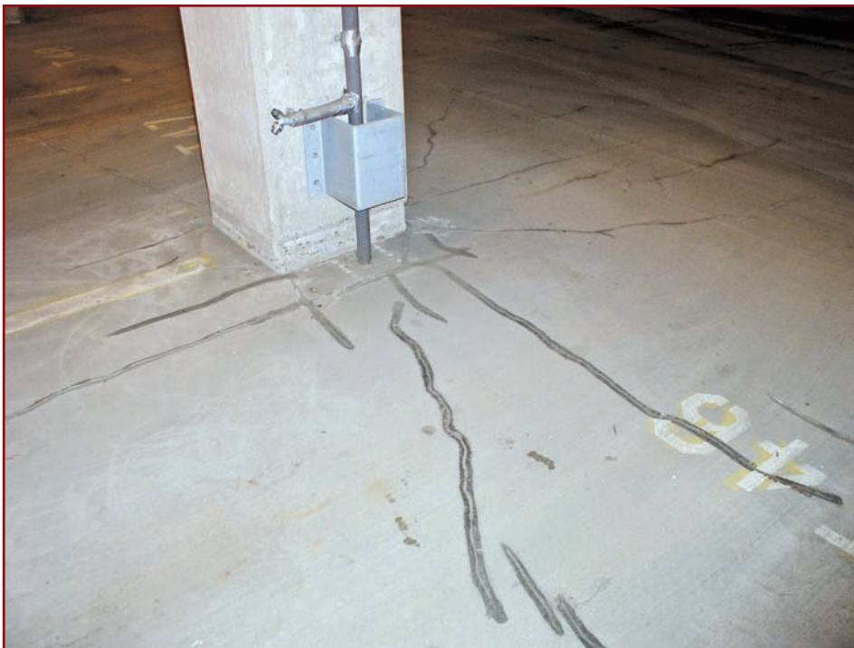
Figure 2 – Cracks are routed and sealed before application of a penetrating sealer.

then migrate to embedded steel reinforcement through the pores in the concrete or penetrate through cracks. Once they reach the steel, the salts cause expansive corrosion, ultimately resulting in unsightly, destructive, and costly deterioration of the structure.