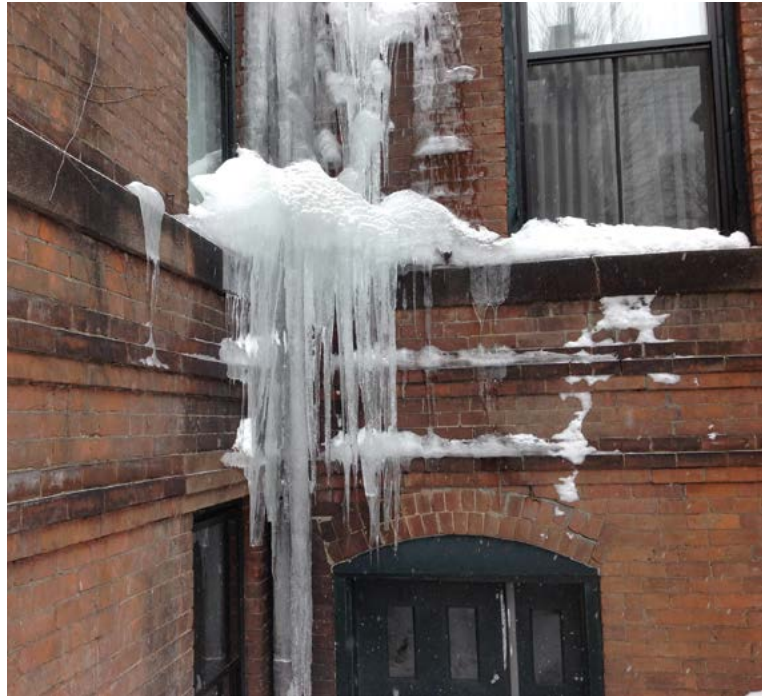
Conducting assessments in different seasons permits observation of varying weather-related conditions on multi-building campuses.