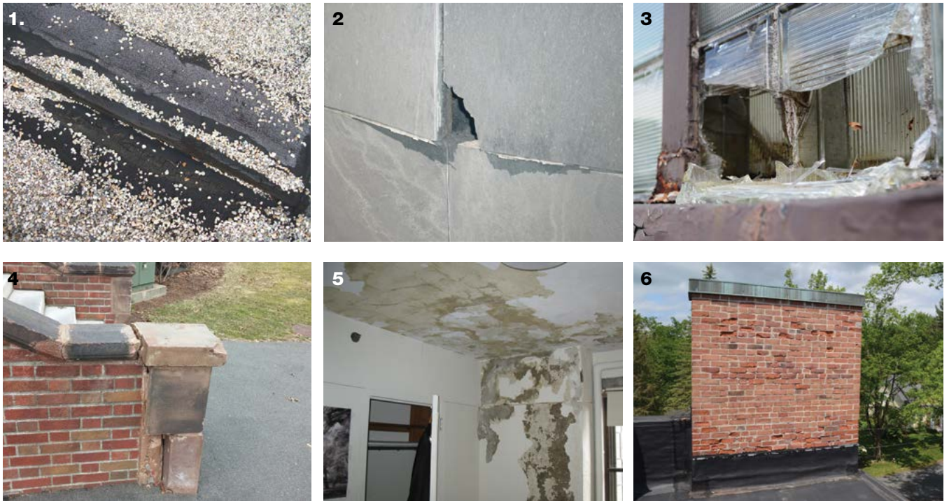
Sample conditions observed during a building envelope assessment of nearly 60 buildings on the urban university campus pictured on page 6 led to a long-range maintenance and rehabilitation master plan. Shown are examples of deteriorated roof membrane (1), displacement and fracture at stone façade (2), shattered glass-block windows (3), site wall and exterior stair damage (4), interior finish damage from roof leaks (5), and spalled brick masonry at a chimney (6).

To evaluate the performance of building envelope elements under different climate conditions, it is beneficial to conduct observational site visits at different times of the year. An investigation in the spring might pick up on cracked foundation walls that would be concealed by snow later in the year, but would miss ice damming or condensation only present during the winter.