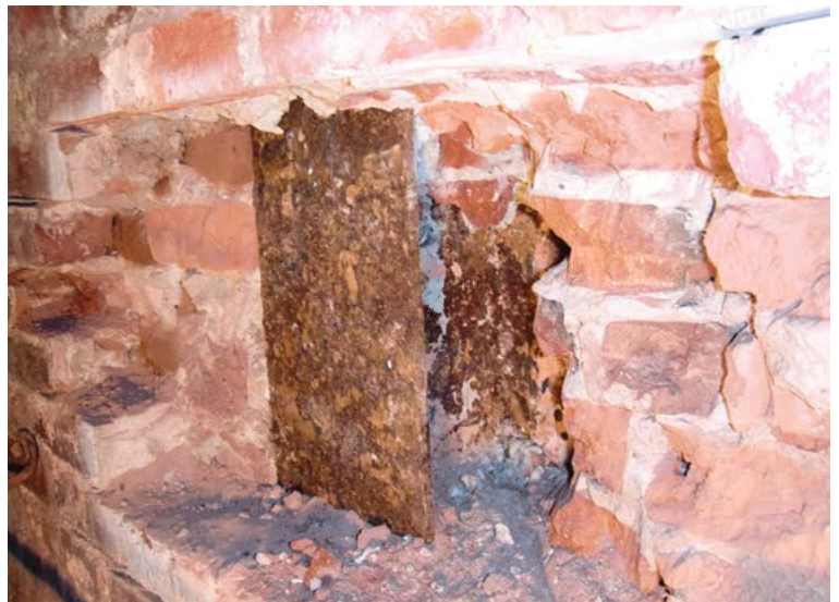
Invasive probes can reveal concealed problems, such as corroded structural steel.

Following the analysis of observed conditions and test results, the building envelope assessment report should provide prioritized recommendations for repair and rehabilitation, including construction cost estimates for each line item and total projected cost broken down by priority level. To facilitate planning and budgeting, a summary document listing any recommended repairs by building is helpful. The report should culminate in a checklist of repairs prioritized based on remaining useful life, organized according to an established timeline. For example, “Priority 1” might be within the next three years, “Priority 2” within the following three years, etc.