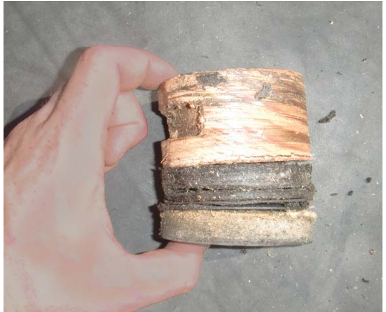
Test cores may be used to evaluate conditions within a roof assembly.

Implementing a water test, via a spray rack or even a garden hose, helps identify where and why an assembly or system leaks. Facilities personnel often deal with recurrent leaks in a particular building over a lengthy period. With a controlled water test, the source of those persistent problems may be identified within a few hours. Further, if indicated, the standardized procedures can measure the rate at which water and air infiltrate an assembly such as a window.