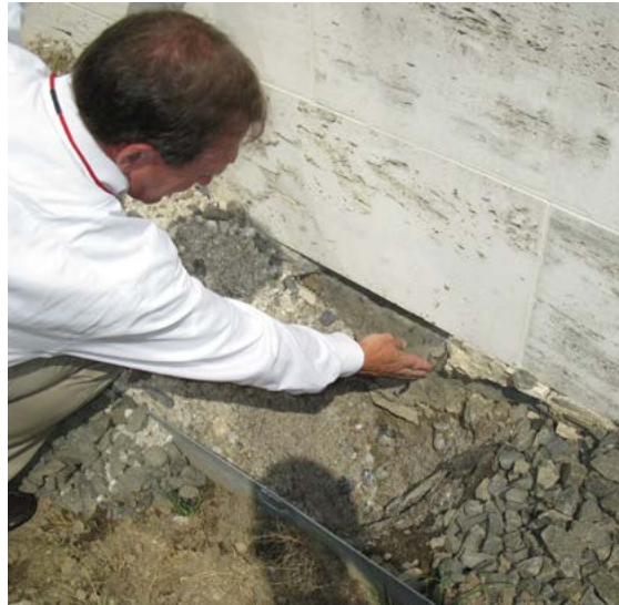
Visual assessment permits close observation of defects at exterior walls.

More general condition surveys might begin with a list of buildings included in the report, accompanied by an overall photograph and basic description of the type of construction and materials. For each building, a more in-depth data sheet could provide a description of each exterior envelope element, including design, construction, materials, and observed defects. Supplemental photographs included with the data sheets provide documentation of typical conditions, as well as highlighting any deficiencies or deterioration. If infrared photography was used or testing was undertaken, the images and results would also be included for each building.