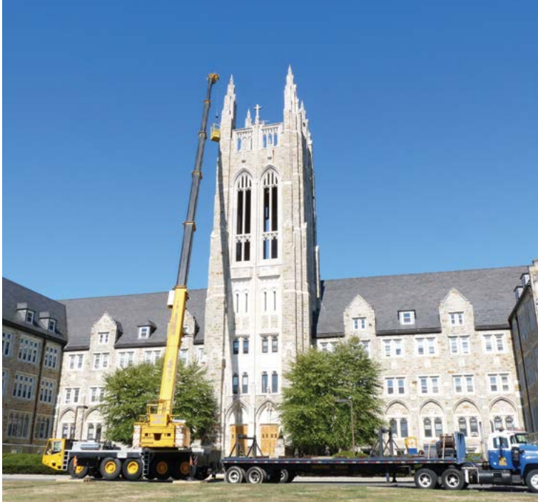
Close-up investigation may be aided by lifts, drops, or other observation platforms.

facility management priorities for both immediate needs and the long-term health of the facility.