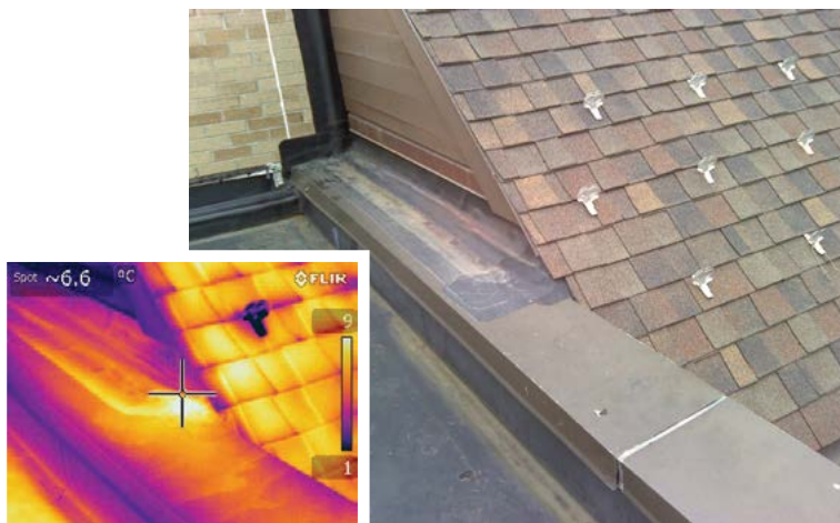
Infrared thermography photographs highlight areas of heat loss with color hues that represent thermal gradients.

the condition. Photography should be utilized extensively throughout the campus assessment. Not only will deteriorated conditions be documented, but a carefully planned photographic survey will also allow the architect or engineer, now back in the office, to evaluate found conditions. Overall photographs of each building elevation, accompanied by close-ups of details, can be transposed or keyed to building drawings.