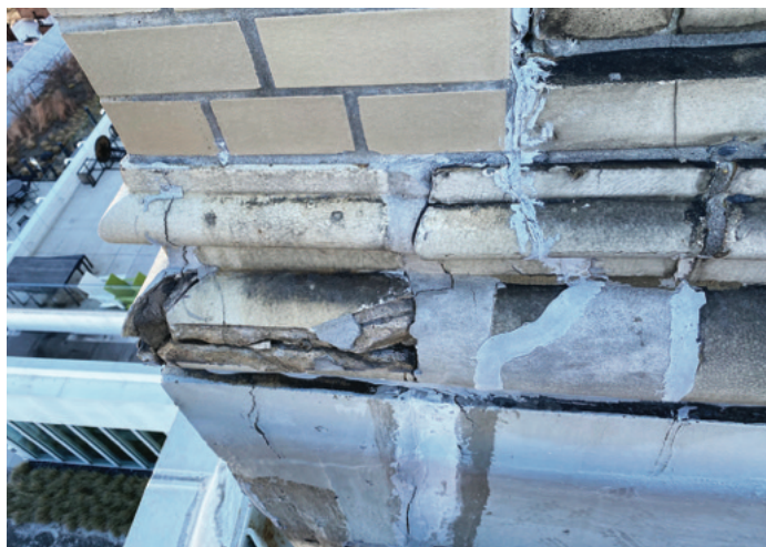
Unsafe conditions demand immediate attention.

Some problems, too, are simply not visible at the surface and require exploratory probes, laboratory analysis, and/or structural calculations to accurately assess the extent of