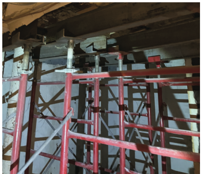
Stabilizing beams until permanent repairs can be made.

Safety ordinances, such as New York City's Facade Inspection Safety Program (FISP), may require design professionals to report observed hazardous conditions and undertake necessary corrective measures within an established timeframe. For example, terra cotta that shows signs of structural cracks, or balcony railings that are