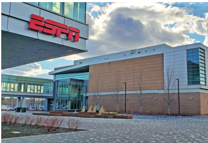
Roof repairs and replacements at this sports headquarters identified sources of leaks and addressed errors in the original construction.

To achieve lasting repairs, root causes must be addressed, and these are often determined through professional evaluation. Such an investigation is a prerequisite to any rehabilitation or repair. If an extended period has elapsed from the time a design professional conducted the evaluation, building owners and managers would benefit from considering re-assessment before investing in a construction project to resolve persistent issues.