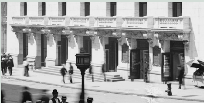
Historical photograph of the doors to the New York Stock Exchange (NYSE) in 1904.

Although treatment of buildings with historic designation may follow a stringent set of guidelines that doesn't pertain to newer structures, these older buildings typically are not exempt from current accessibility and life-safety codes. The challenge is to meet applicable code requirements while minimally affecting—and preserving—defining features and spaces.