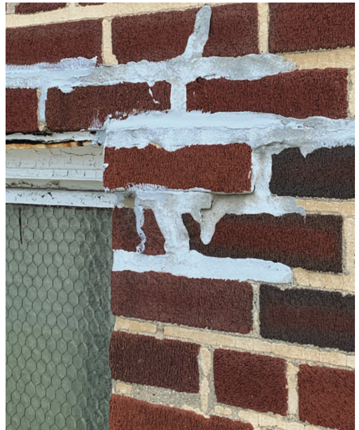
Slapdash repairs can make problems worse.

Prolonged moisture exposure can also lead to efflorescence and cracks, eventually compromising structural integrity. As capillary action drives moisture up into the exterior wall assembly, it can lead to systemic water damage.