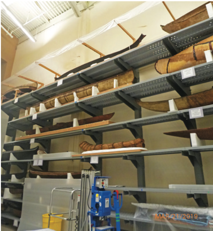
Vulnerable artifacts must be protected.

Energy, however, isn’t the only metric building owners and facility managers should consider when prioritizing repairs and upgrades. With climate change driving an increase in natural disasters such as flooding, extreme heat and cold, and unusual weather patterns, a prudent building manager should consider resilience as a key driver in rehabilitation planning. Foundation waterproofing, roof uplift resistance, window impact tolerance, cladding anchorage, and other measures of a building’s weatherability may prove critical to its ability to recover from extreme weather events. Furthermore, proactively protecting a building from the elements—and documenting these efforts—is critical if storm damage necessitates an insurance claim.