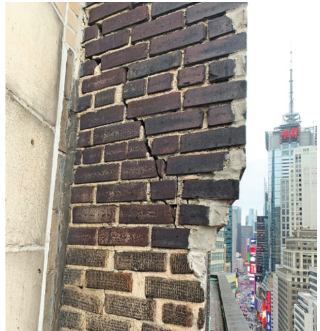
As maintenance is deferred, cracks and spalls proliferate into emergency hazards.

Continuous air and vapor barriers applied to the back-up structural wall prevent the moisture that does accumulate from migrating to the building interior. Signs that such barriers are damaged, missing, or non-continuous include leaks, moisture at window and door openings, condensation, and the growth of mold and mildew.