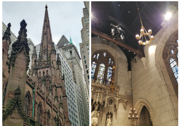
Roof leaks above the organ and nave of this Manhattan church threatened the sacred spaces and statuary below.

Costly unexpected repairs can pose major financial burdens, so staying on top of maintenance is key. A design professional should conduct periodic reviews of the building to catch problems early, before they evolve into disruptive and costly repair projects. For newly restored or replaced components, maintenance staff should be trained to clean, treat, and repair areas, based on the materials. Certain