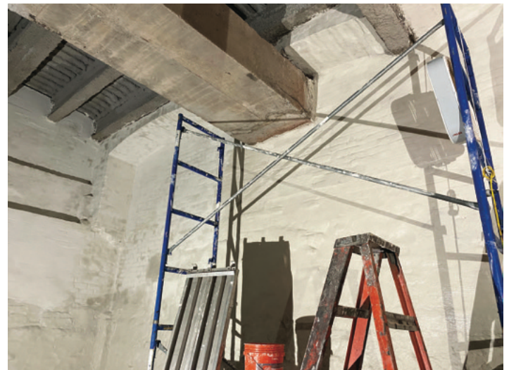
Left: Positive-side foundation waterproofing is applied to the exterior. Right: Negative-side waterproofing is on the interior.