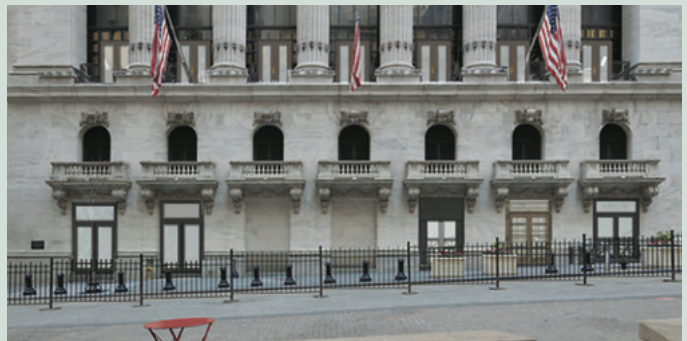
NYSE door design options proposed to the NYC Landmarks Preservation Commission.