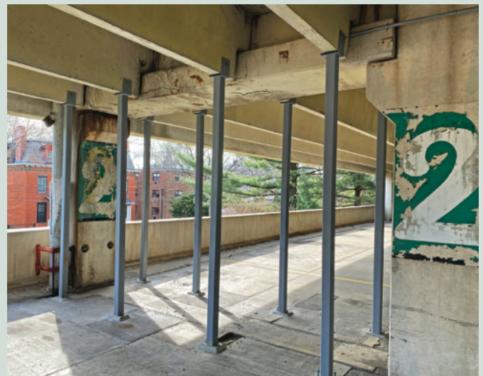
Temporary shoring at a deteriorated garage beam.

Recognizing the physical and functional differences between building enclosures and parking garages is important when considering repair work. By their design,