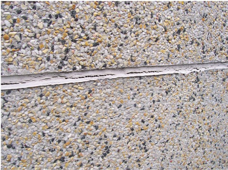
This is an example of cohesive failure where the sealant tears within itself.