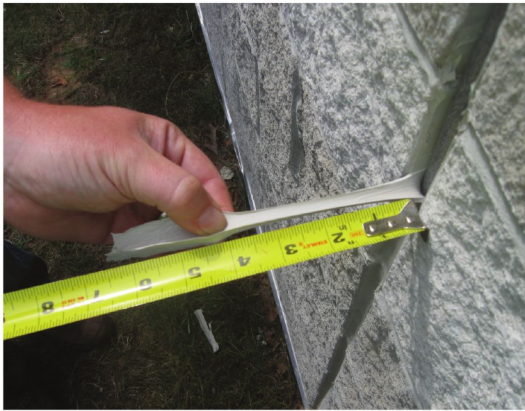
Peel tests are used to evaluate sealant elongation and adhesion.