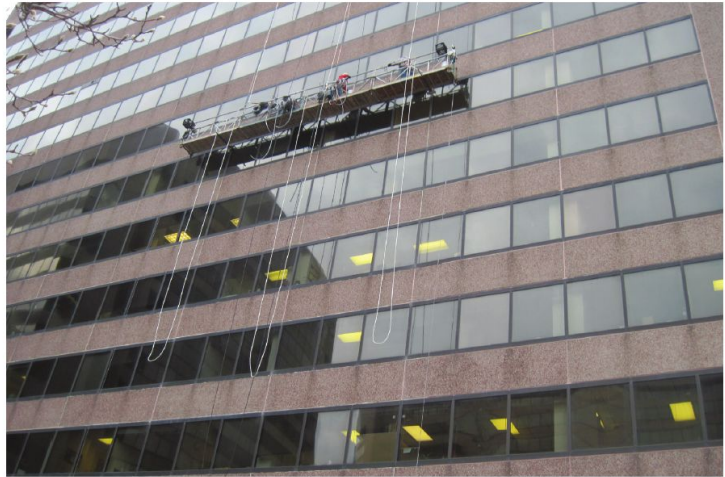
Sealant investigation at this glazed curtain wall uncovered application deficiencies compromising the weather integrity of the façade.

The limited lifespan of sealants means they inevitably need to be replaced. Achieving the full expected service life of a sealant typically requires a combination of correct joint design, appropriate sealant selection, product performance testing, appropriate surface preparation, and conformance to manufacturers' guidelines and industry standards. A good reference is ASTM C1193, Standard Guide for Use of Joint