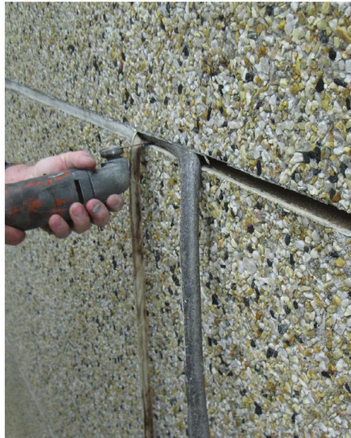
Façade sealant replacement begins with complete removal of existing sealant and backer rod.