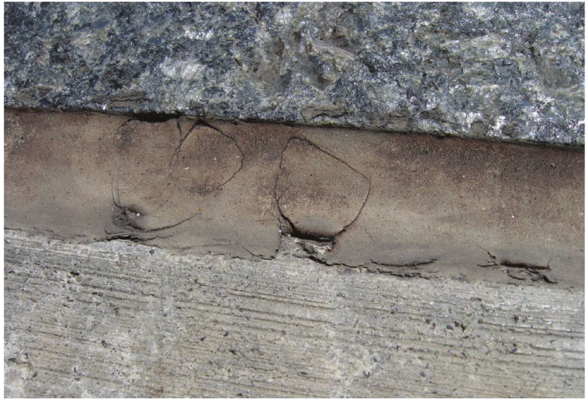
Special additives and hardeners are manufactured specifically to resist damage from high heels because they can puncture sealants at joints.

Properly designed sealant joints generally have a 2:1 width-to-depth ratio, a configuration allowing the joint to accommodate movement most effectively. Additionally, many manufacturers stipulate maximum and minimum dimensions in order for the sealant bead to perform within its movement capability.