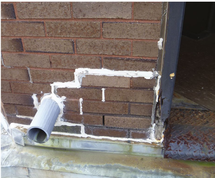
A sealant is being misused to repair mortar joints in this building.

exposure resistance include flexibility at low temperatures, freeze-thaw resistance, UV stability, and susceptibility to heat aging.