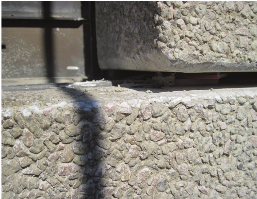
Insufficient joint preparation can compromise sealant adhesion. Debris and residue must be cleaned prior to new sealant installation.

Weather conditions on the day of application can affect sealant performance. A significant percentage of sealant failures may be attributed to noncompliance with manufacturer instructions regarding installation. Ideally, sealant should be installed at the median of the design range, meaning the sealant has room to elongate or compress to accommodate fluctuations in temperature. If the sealant is installed in very cold weather, for instance, the substrate has shrunk and the joint is at its widest. As the weather warms and the substrate expands, compressive forces may exceed the sealant's tolerance, leading to failure. The converse is also true; sealant installed in hot weather may stretch beyond capacity as the weather cools and the substrate contracts. Sealant installed at moderate temperatures retains the flexibility to accommodate the upper and lower ends of the design range.