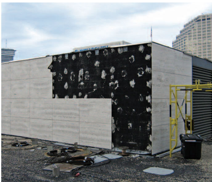
Penthouse marble panel replacement in process.