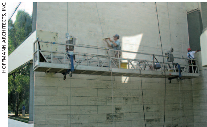
Periodic sealant replacement should be part of a comprehensive maintenance program.