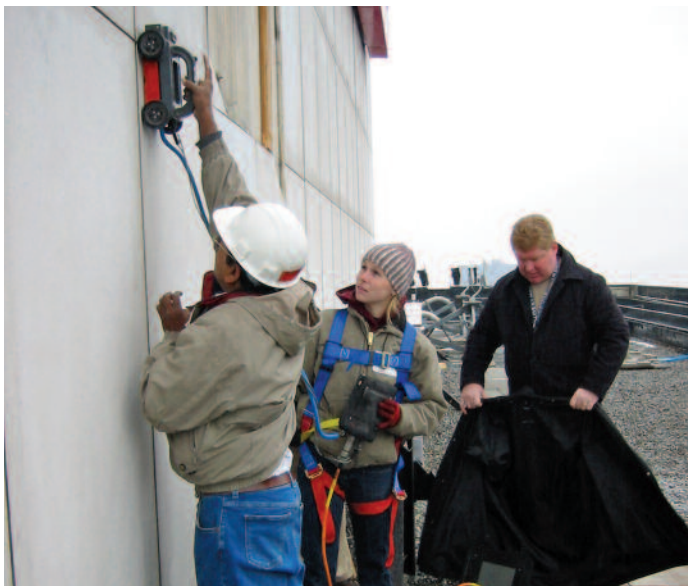
Ground-Penetrating Radar (GPR) identifies anchor locations without removing panels.