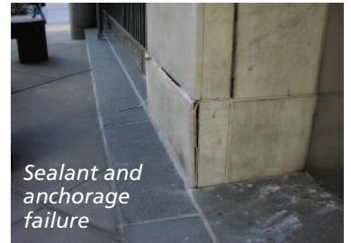
Sealant and anchorage failure