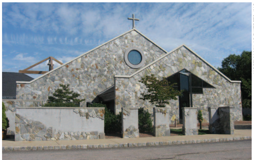
Exterior rehabilitation of this chapel addressed water infiltration, rust staining, sealant deterioration, and other problems at the thin-stone-veneer facade.