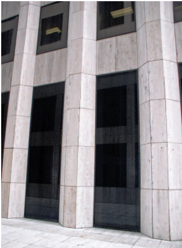
New stone-cutting technology permits thinner marble panels—and brings new design challenges.