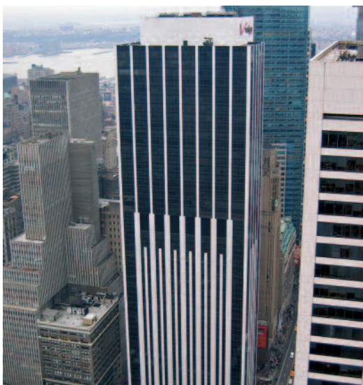
The unique material properties and design challenges of stone veneers demand accurate diagnosis to correct deficiencies.