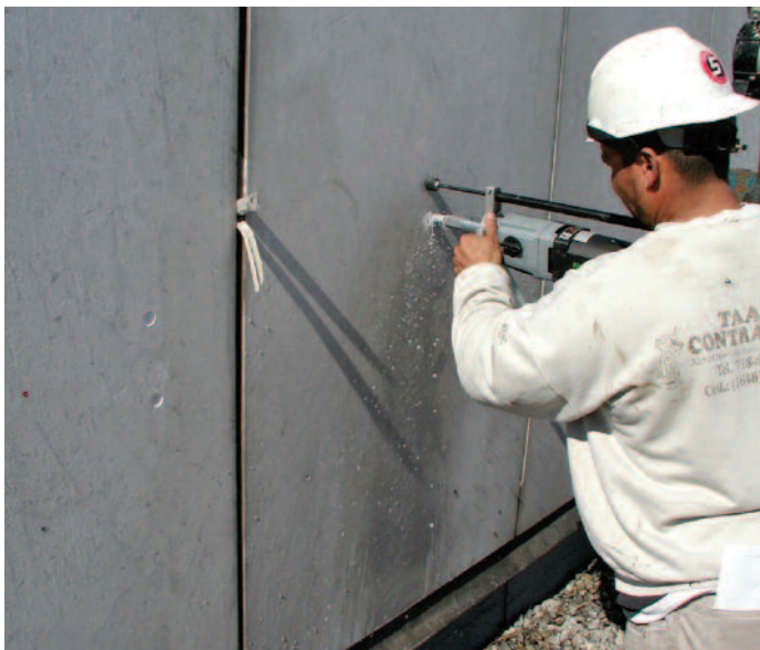
Face-pinning is often used as a safety measure to prevent loose panels from falling.