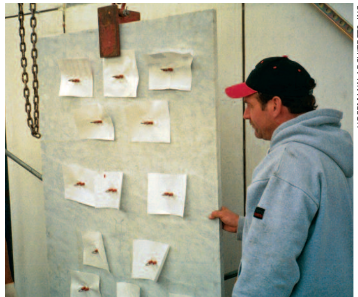
Replacement panel mock-up to assess anchor geometry and installation protocol.