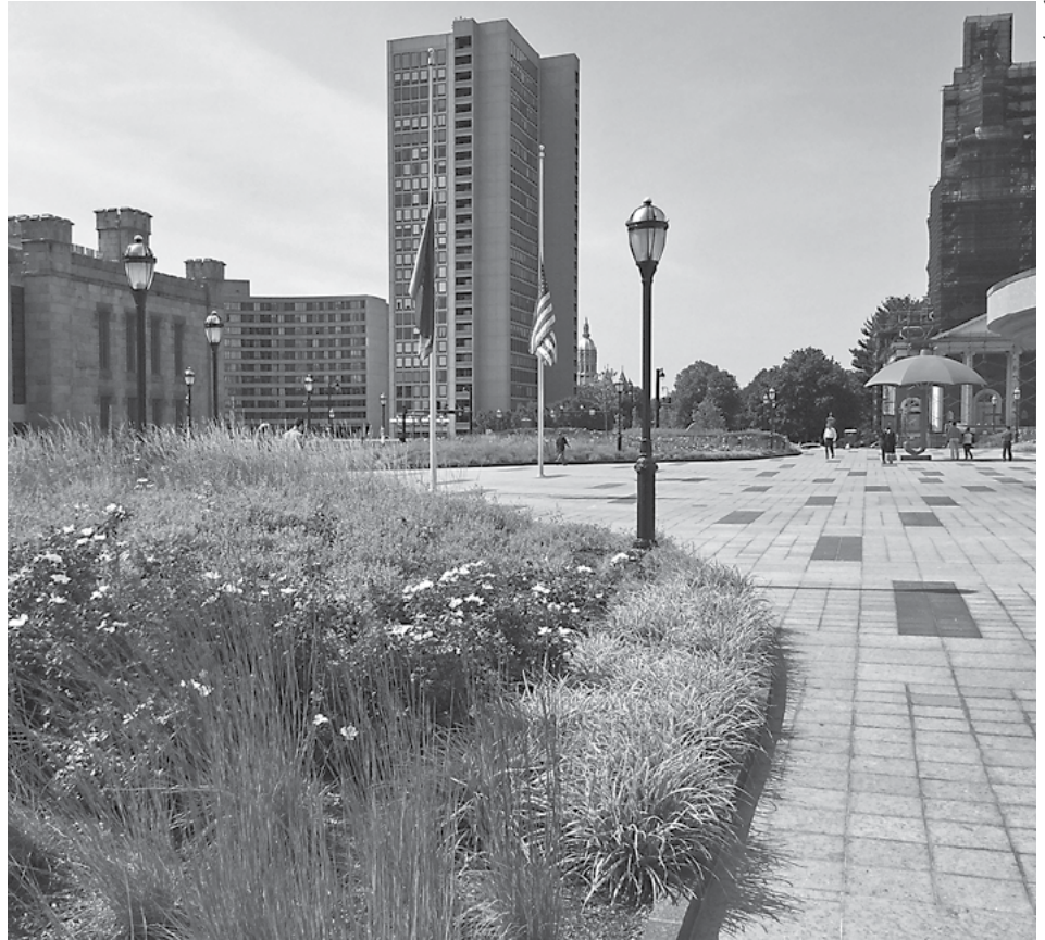
Traveler's Plaza, Hartford.