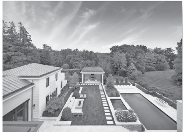
Material: Ramon Grey Limestone and Liberty Hill veneers

* Bridgeport, Danbury, Hartford, and Stamford