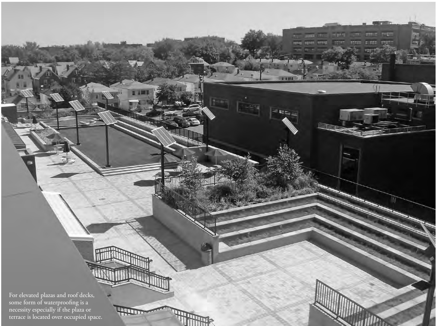
For elevated plazas and roof decks, some form of waterproofing is a necessity especially if the plaza or terrace is located over occupied space.